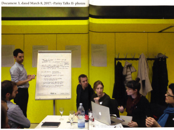
Document 3, dated March 8, 2017: 'Parity Talks II' photos

single one of these PhD theses had been produced under a female supervisor. While some of the former doctoral students seem to have literally disappeared after earning their degree, a handful have ended up in positions far below their level of qualification. Many others have pursued careers outside ETH Zurich, whether in Swiss Universities of Applied Sciences or abroad. 8 It seems to be instances like these, in which the otherwise deceptively abstract phrase of the 'leaky pipeline', taken on a personal dimension.