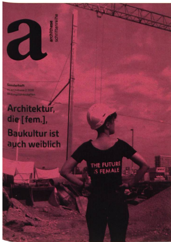
Document 5, dated June 8, 2016: special issue of Archithese 'Architektur, die [fem.], Baukultur ist auch weiblich!', no. 2 (2016)