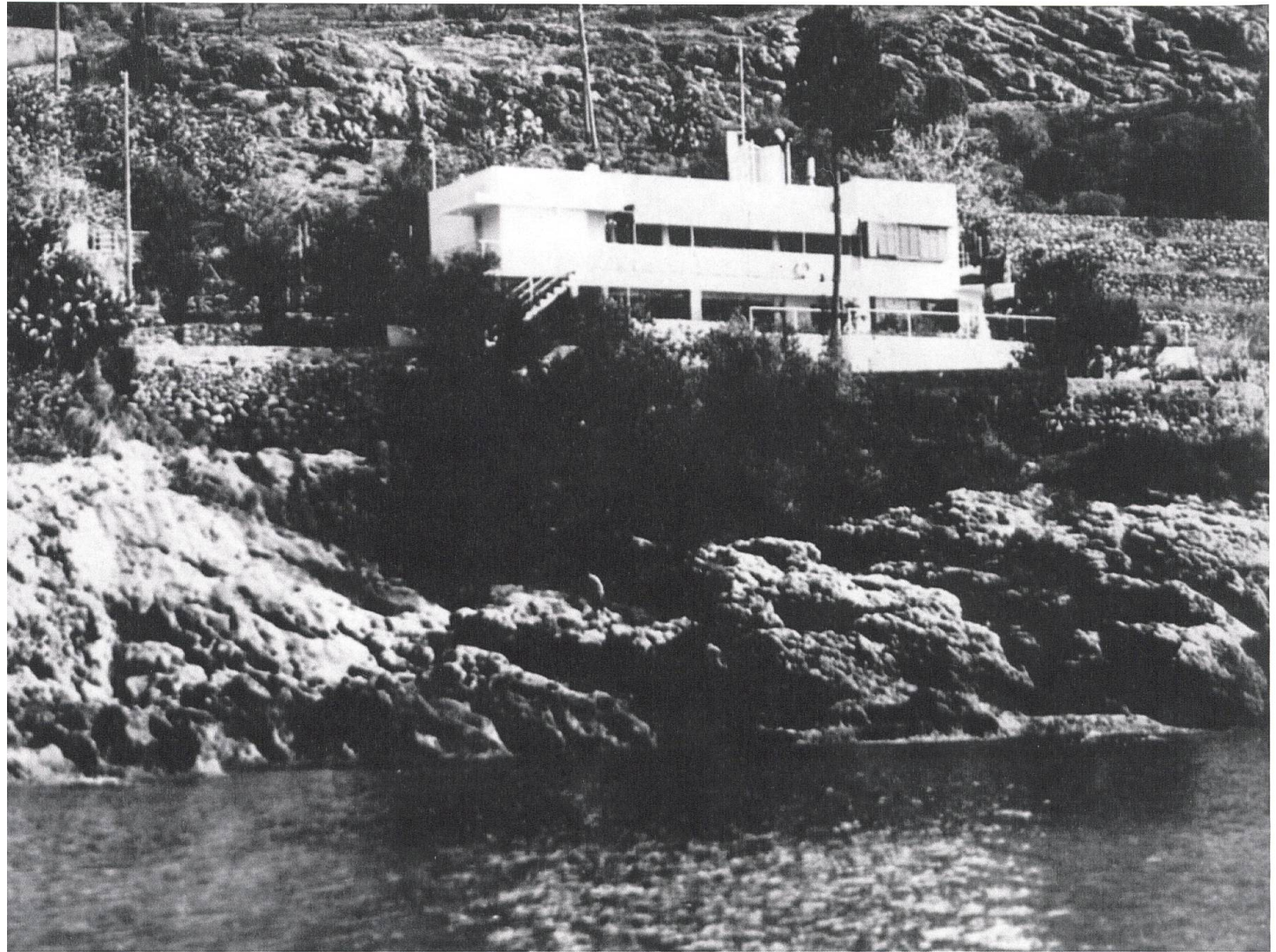
View of E.1027 shortly after 1926

Uninhabited for many decades, the house deteriorated. In order to protect his murals, Le Corbusier eventually persuaded a supporter to buy the house. The villa was often attributed to Le Corbusier. Through more recent attention, Eileen Gray has gained recognition for the villa and for her work. She continued to work as a designer until her death at the age of 98 in 1976. The house has now been refurbished.