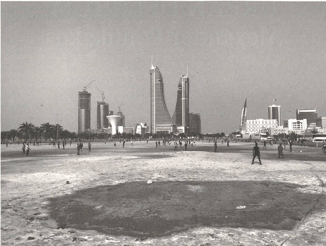
View of Bahrain's Financial Harbor.