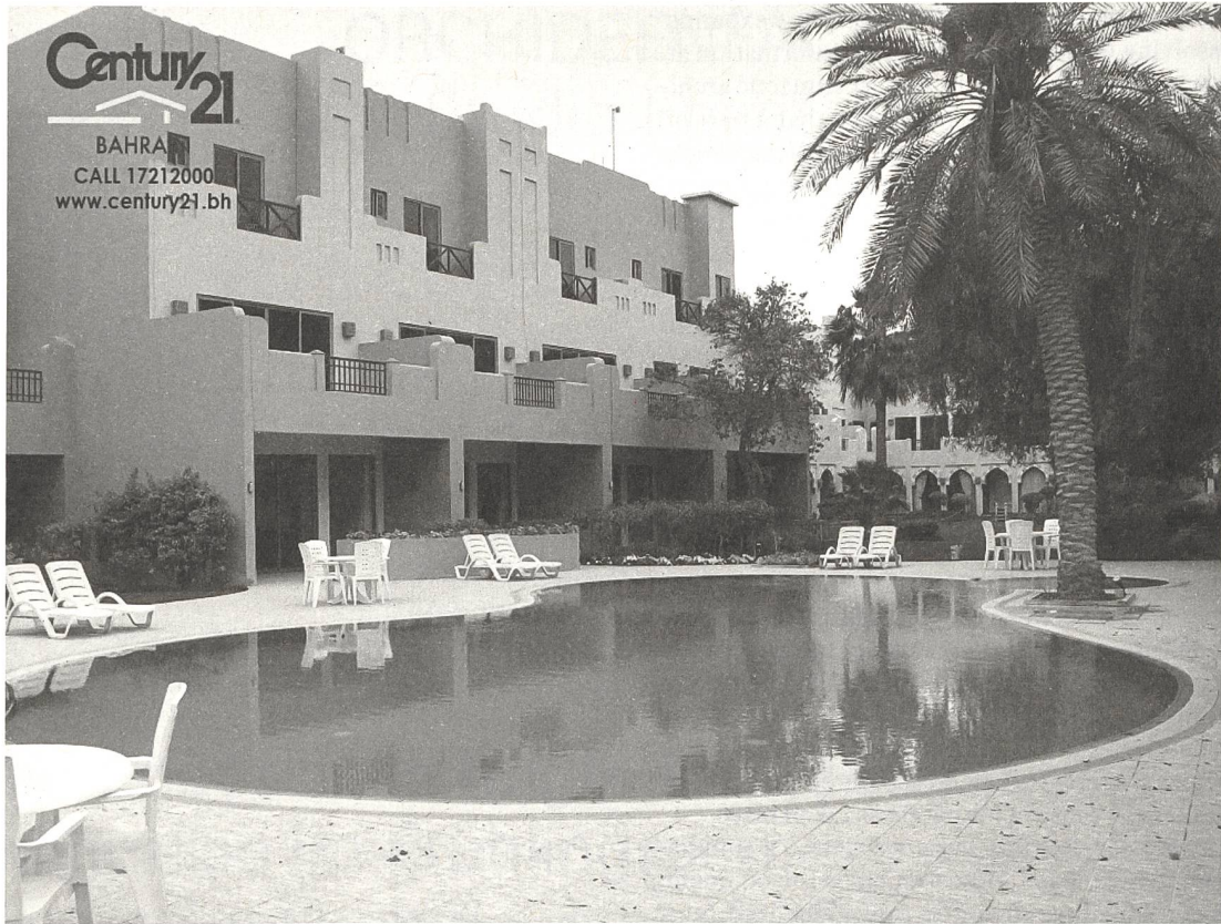
Dilmun Homes Villas, Adliya, Bahrain, 2016