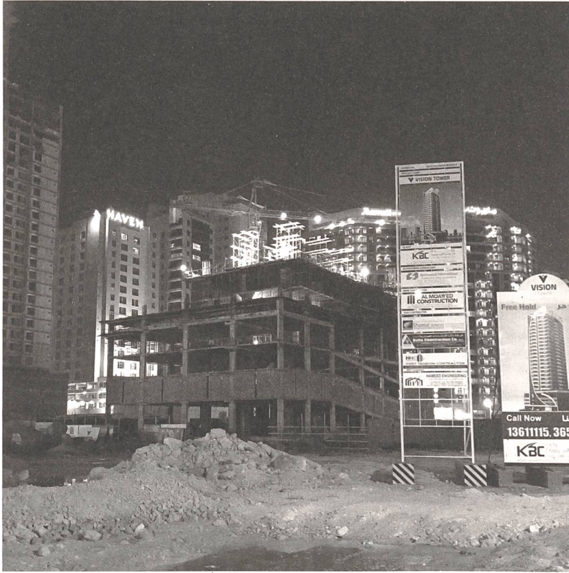
Al Juffair, Bahrain. Photograph: Alexander Poulikakos, 2016