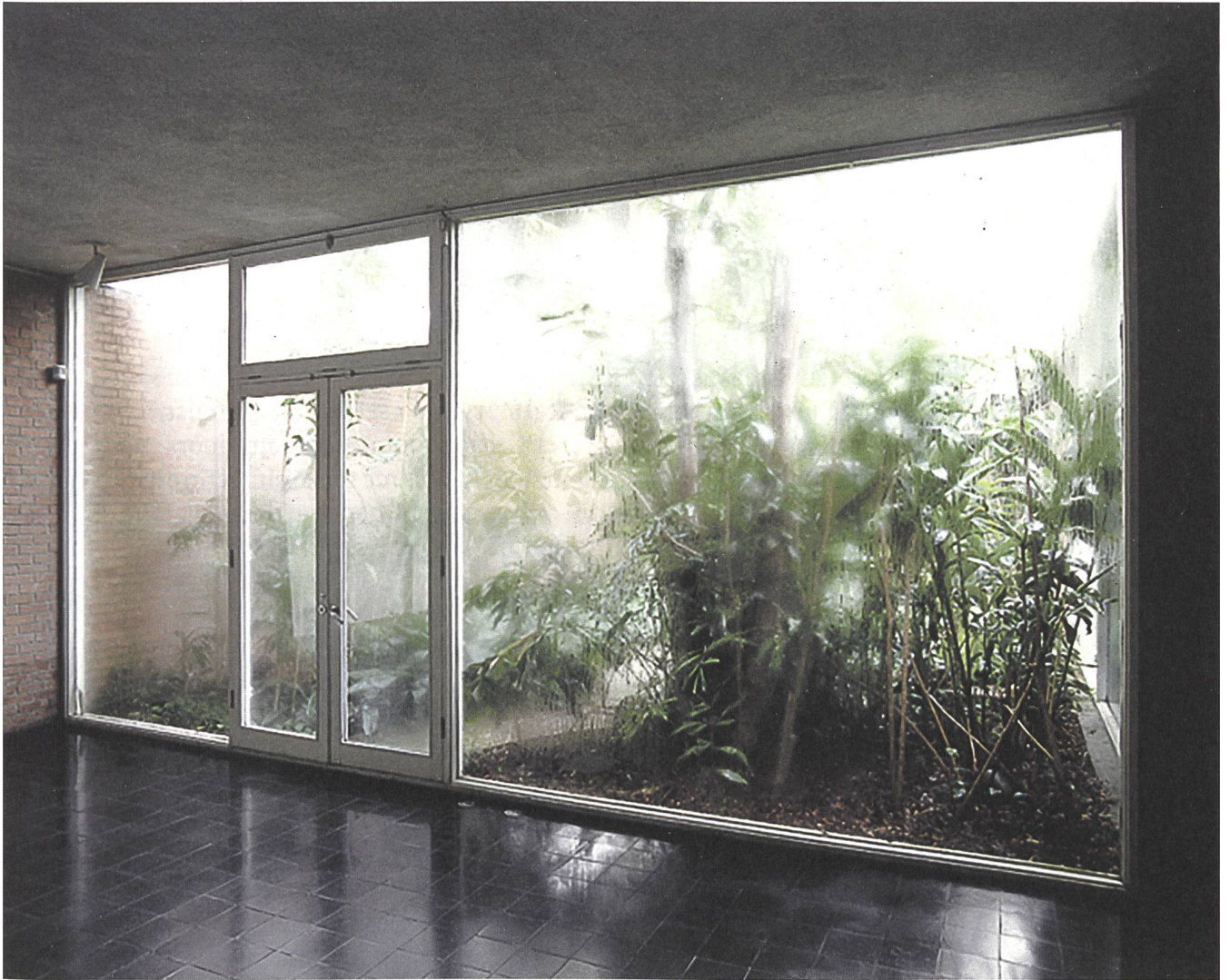
Untitled (Menil House, #10), 2002