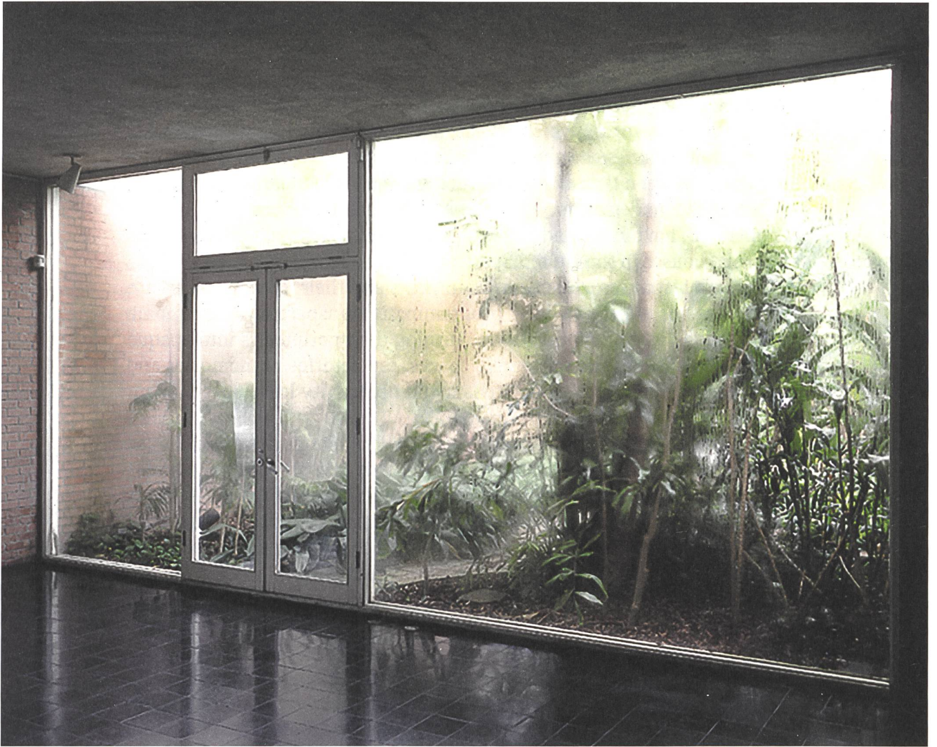
Untitled (Menil House, #04), 2002