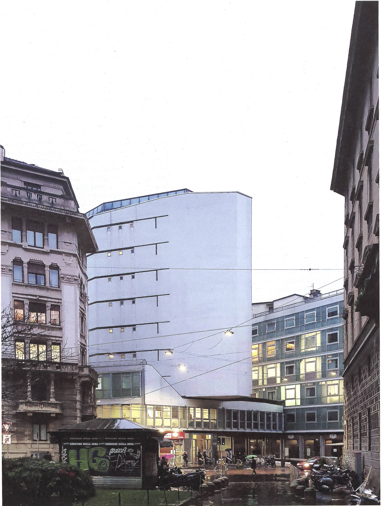
C Luigi Moretti, Residential and office complex on Corso Italia, Milan (IT), 1949–1956, view from Piazza Bertarelli to the central building. Photography: Federico Taverna, 2019