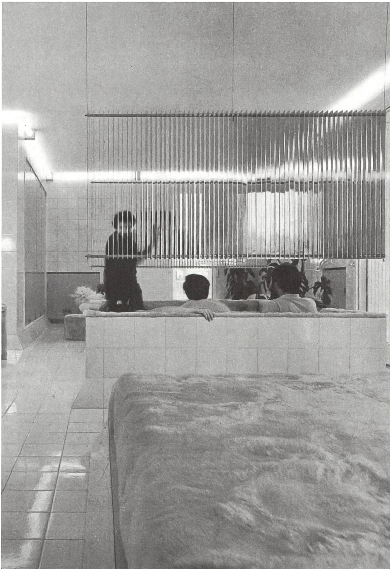
A Completed house. Copyright: Casali/Domus C View from the bed to the «conversation pool». Copyright: Casali/Domus