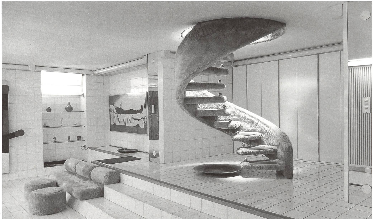
D View from the entrance hall towards the staircase.