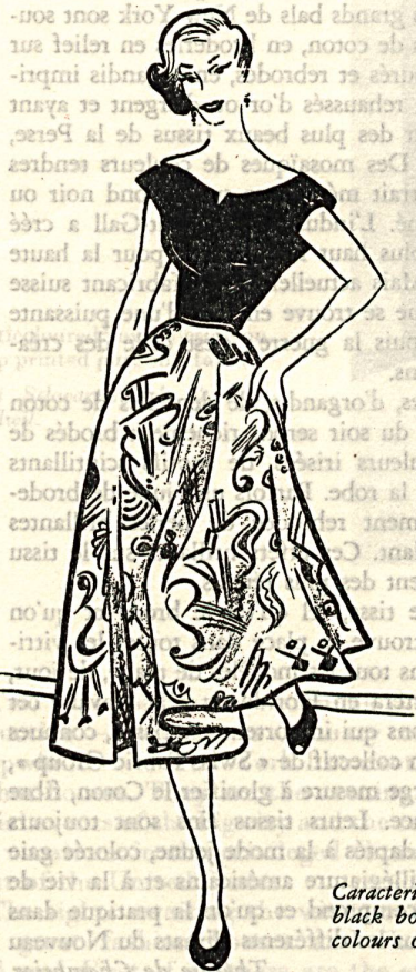
Characteristic line of this season: black bodice and skirt with bright colours on a clear background.

Let us take, for example, the field of printed fabrics.