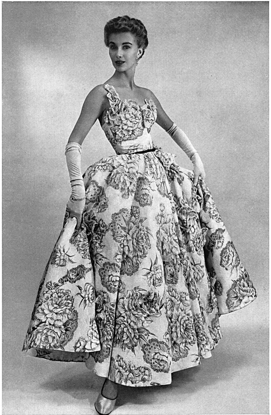
SWISS FABRIC GROUP, NEW YORK Multicoloured floral print on « Creperl » crinkled organdy.