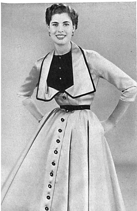
SUSAN SMALL Gold Duchess gaufre embossed satin from Haas & Co., Zurich

The big news in fabrics is velvet. An avalanche of velvet everywhere: for evening wraps, afternoon suits, daytime coats; for hats, blouses, cocktail dresses, ball dresses; for trimmings — collars, cuffs, pocket facings, linings. There is lots of black velvet; much coloured velvet, too. Embossed velvet, velvet appliqué with white grosgrain spots; street velvet, uncut velvet; and, at Sherard, a new straw velvet in a lovely spindleberry pink. Another sensation in fabrics for day is Donegal tweed, used more than ever before for greatcoats and suits, sometimes trimmed with velvet or fur. For evening and cocktail dresses there is a good deal of lace, tissue-paper taffeta, jersey. There is rich brocade, silk-satin, lamé, and satin-striped organza. Some suits are worn with blouses of velvet, lamé, organdie or fine lace.