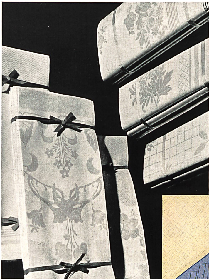
Table linen created by Worb & Scheitlin Ltd., Burgdorf.