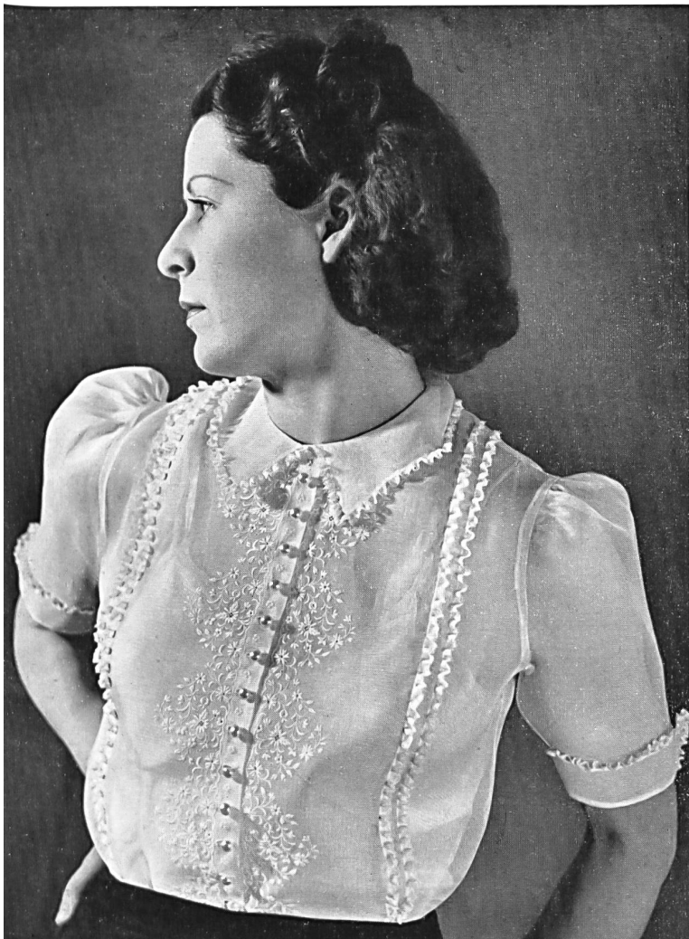
Embroidered organdi blouse by Haury & Co., St. Gall.

no doubt that the light and filmy textiles such as laces and organdi will retain their popularity but nevertheless the power wielded by the black silk dress (always greatly appreciated on account of its distinction and perfect taste) will never be forfeited.