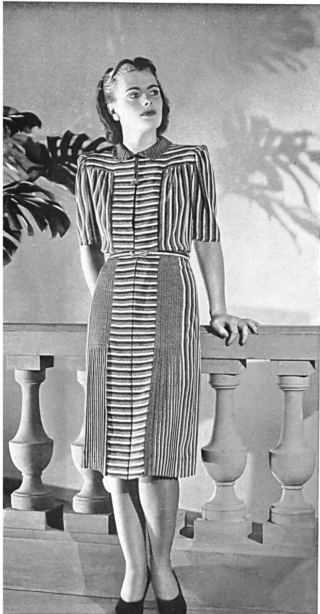
Silk dress by C. Baumann, Zurich.

The workrooms at Zurich which specialise in ladies' wearing apparel have the extremely delicate task of interpreting the different tendencies of Fashion as created by the dress-designers of leading fashion-houses. Their choice is always dictated by the edicts of good taste and the dictates of common-sense.