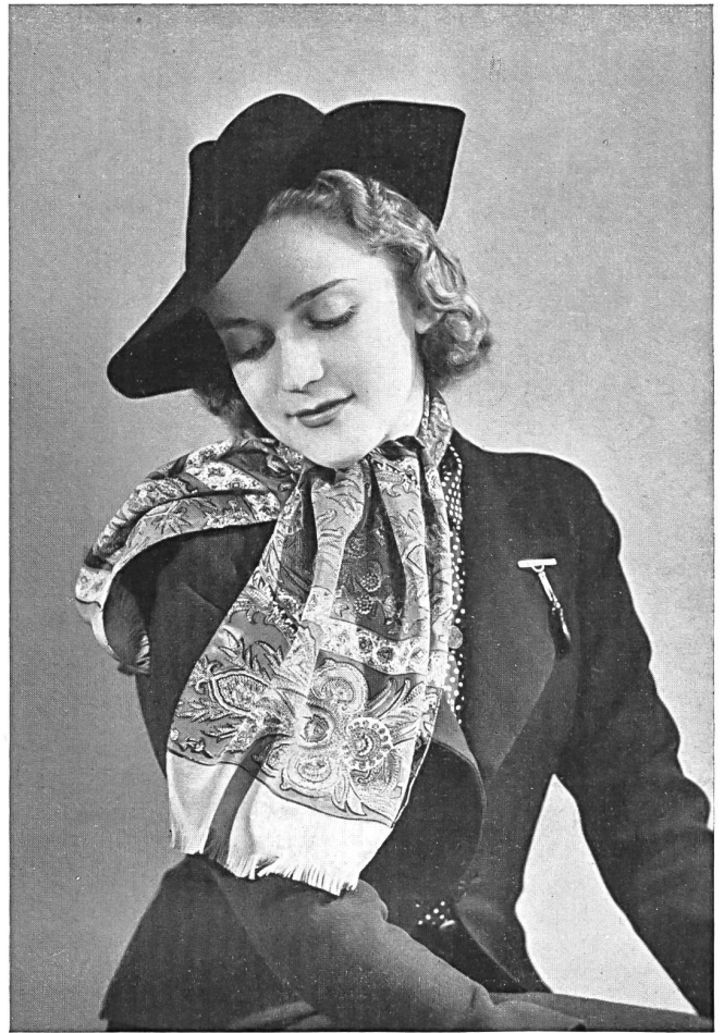
Silk scarf by F. Blumer & Co., Schwanden.

For afternoon-wear chic suits and charming flared coats to be worn over little dresses in silk or printed "rayonne" are being made. The coats are usually black or navy-blue, but grey and grey-blue tones are evidencing a certain popularity this spring. Boleros, seen already last year, are both practical and delightful. At little cost, they allow the well-dressed woman to vary the contents of her wardrobe. Take, for example, the pleasing and practical afternoon outfit which can be achieved by a tailored skirt worn with a light blouse and bolero. The choice of cut, colour and material for dinner and evening dresses is indeed very great. During summer, there is