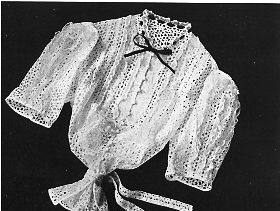
Blouse by Ed. Sturzenegger Ltd., St-Gall.

to a tailor-made costume is a discreetly elegant blouse in white lace or organdy, trimmed with open-work or embroidery. Raised woollen embroidery is seen on elegant afternoon dresses. All such dainty articles, cobweb lace by the piece for blouses and frocks, insertion, motifs for lingerie insets, collars, handkerchiefs, scarves, and flowers are produced by St. Gall manufacturers. Swiss embroidery may be worn at any and every age. It is equally fascinating on children's frocks and on glamorous evening gowns. Who would not take pleasure in dainty lace incrustations