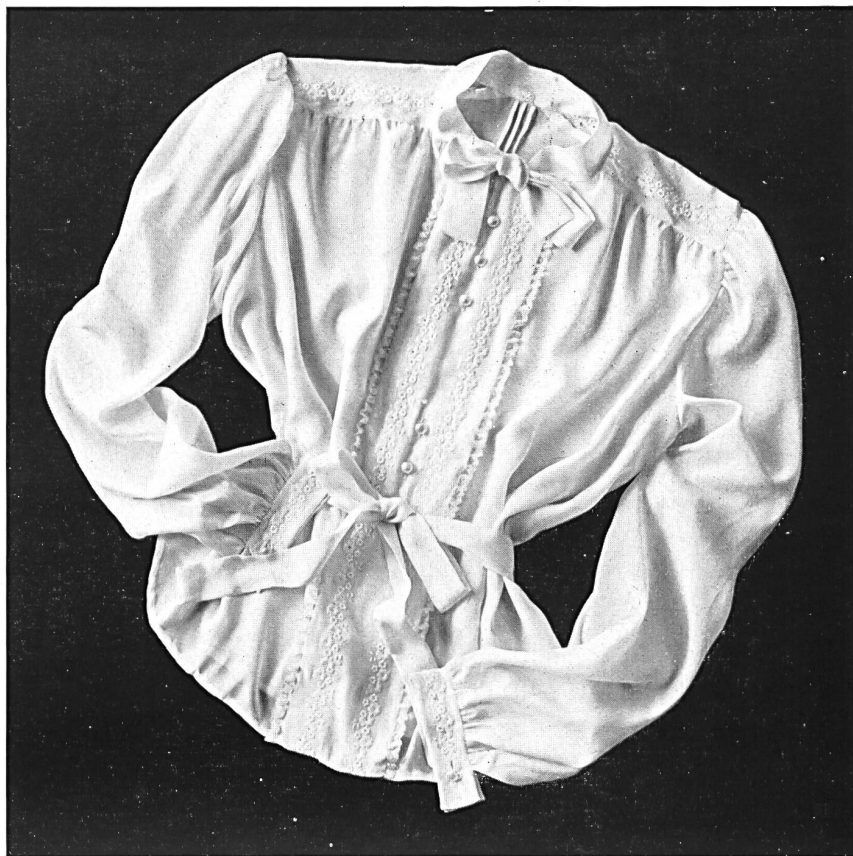
Blouse by Haury & Cie, St-Gall. Photo de Jongh.

Embroidered fabrics by C. Foster-Willi & Co., St-Gall. Photo de Jongh.