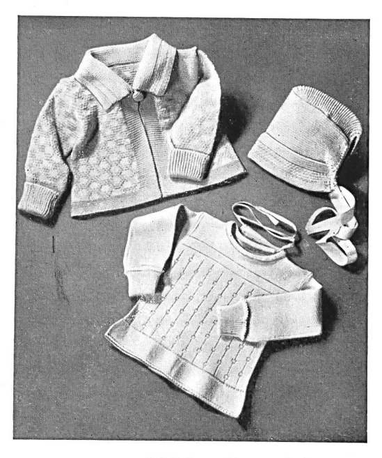
"molli" Knitwear. Ruegger & Co, Zofingen.

Extremely practical as the remarkable creations placed on the market by Swiss manufacturers are, they are none the less noted for their figure-moulding lines. Undies, nightgowns and every kind of luxury lingerie are often trimmed with lace or embroidered tulle. In some cases the trimming consists of sun-ray tucks or frills of the latest style.