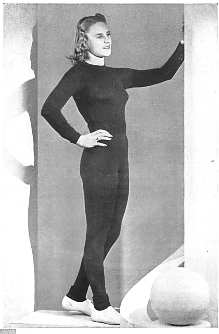
A set of ladies' ski underwear in unshrinkable wool, a speciality "Hisco" by His & Co. Ltd., Murgenthal.

Winter underwear for women, men and children is available in all wool of a very fine and soft quality, guaranteed unshrinkable. There are garments for day and night wear, pullovers, shawls, seamless pants for men, and charming little garments for children of all ages.