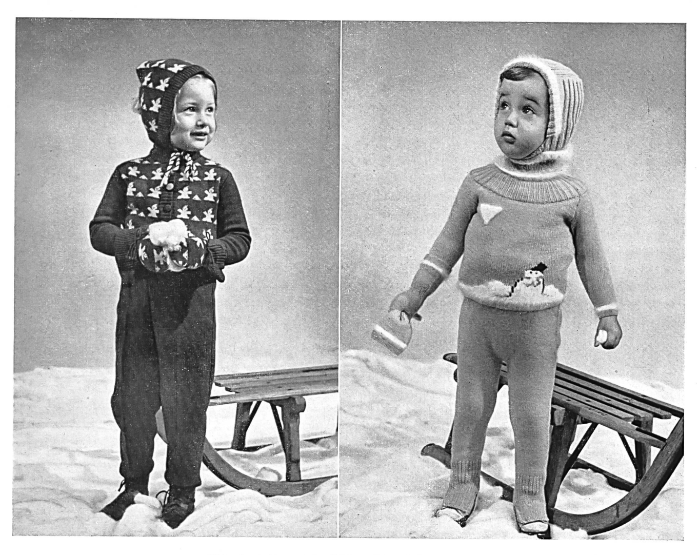
Winter Sports Garments for Children. Geiser & Co., Ltd., Huttwil.

There is less ornamental knitted underwear for every-day use and for sports wear, special progress having been made in this line during the last few years. Silk stockinette combines incredible durability with an extremely fine texture. The garments are most carefully made. They are pleasant to wear and fit perfectly, while