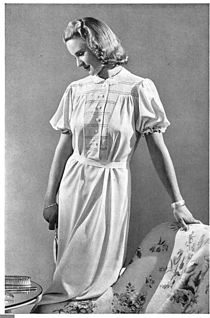
Jersey silk night-dress "Opaline" by A. Naegeli Ltd., Winterthour.

In these days, when bathing plays so prominent a part, charming bathing and beech costumes, and shorts figure in every collection. Being thoroughly elastic in every direction, owing to the use of fine Lastex yarn,