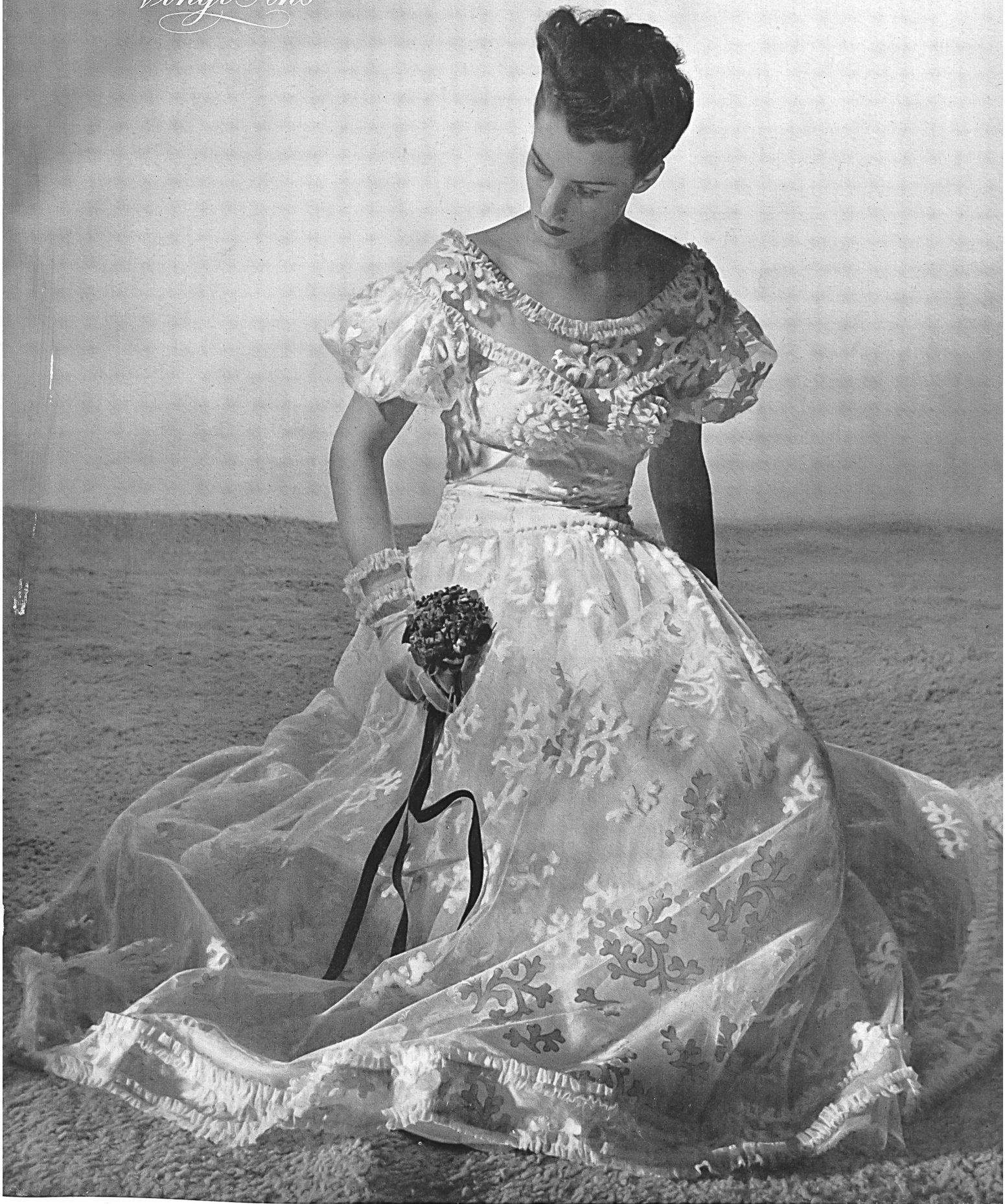
« Varch d'or » : Sauvage-Couture. Gold embroidered tulle with applications by Tul bordado de oro con aplicaciones de A. Naef & Co., Flawil