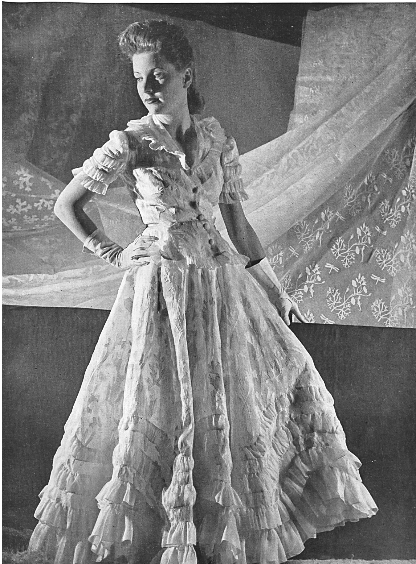
« Algues blanches » : Andrée Wiegandt. Lawn with applications of white nainsook : Linón con aplicaciones de nanzú blanco : Bischoff & Muller Ltd., St. Gall.