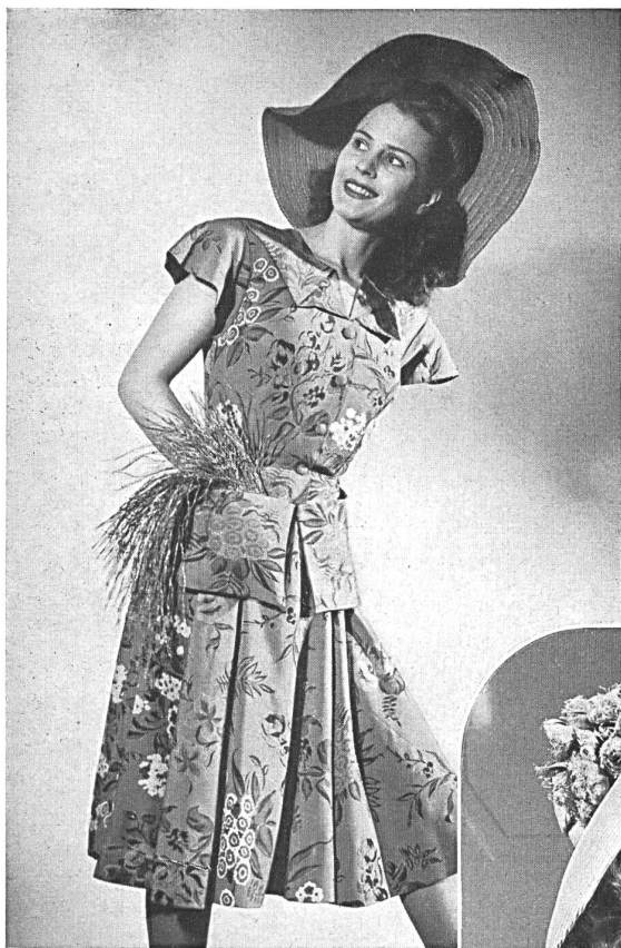
Rob. Schwarzenbach & Cie, Thalwil. Toile Douppion en fibranne, imprimée. Staple fibre douppion, printed. Tela Douppion de fibrana, estampada. Modèle Sauvage Couture.