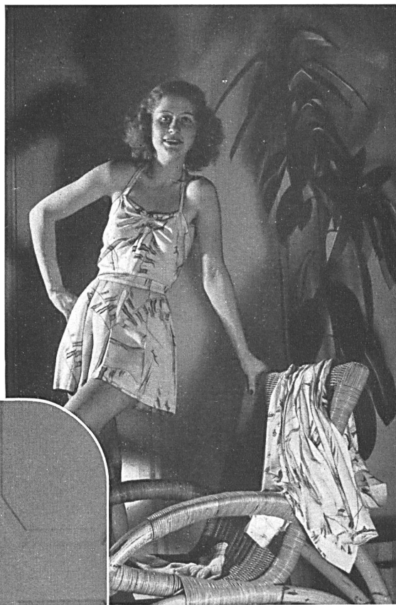
Emar, Tissage de soieries S. A., Zurich. Popeline imprimée en fibranne. Printed staple fibre poplin. Popelina estampada, de fibrana. Modèle Rey-Marchal.