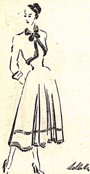
A Fred Schlatter model in Swiss fabric