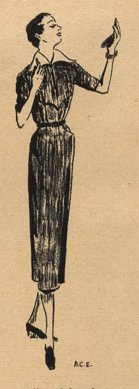
A smart flannel dress by Marcus. The neat white piqué collar with black bow tie is detachable.

White eyelet dress trimmed with white roses of same material, by Julian Rose.