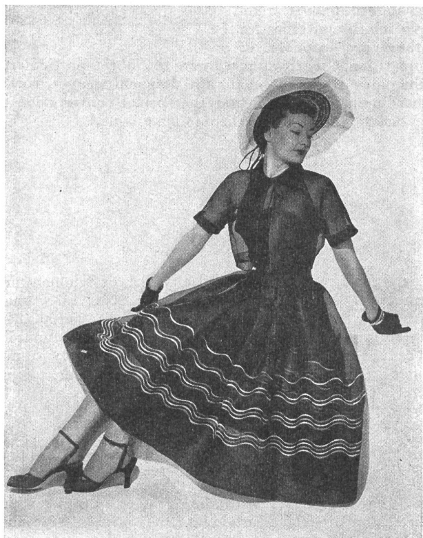
Afternoon dress by L. Aldrich in navy blue Swiss organdy.

Swiss fine cottons : batiste, voile, dotted Swiss, organdie, etc. were presented in the form of models for the