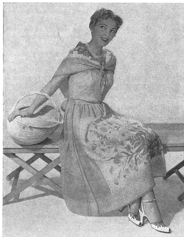
Dress by « L'Aiglon » en crush resistant Swiss voile.

summer by thirty-seven American clothing manufacturers. It was a case of showing that fine cotton fabrics such as are made in Switzerland are particularly well suited to American fashions and climate, for all occasions during the day and evening, not only because of their