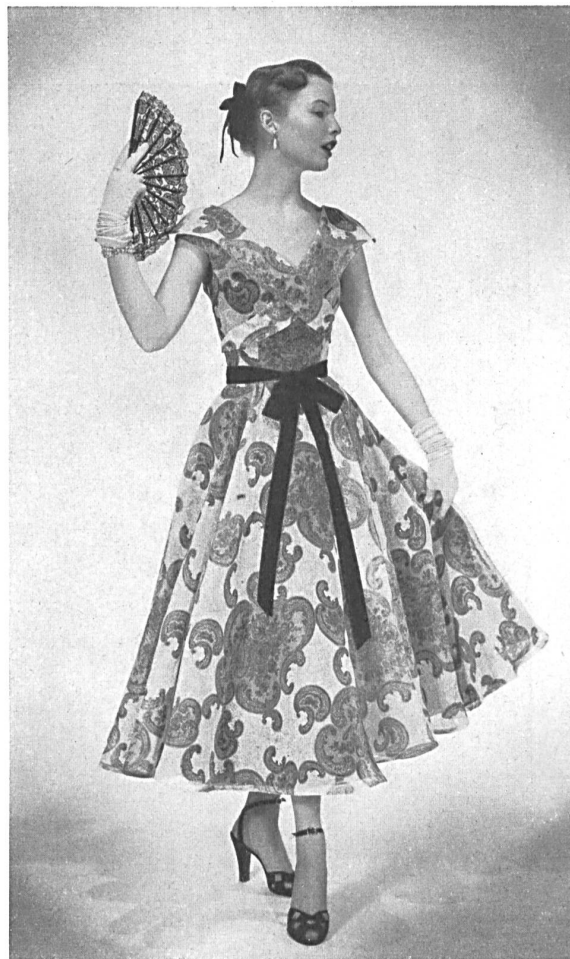
SWISS FABRIC GROUP, NEW-YORK