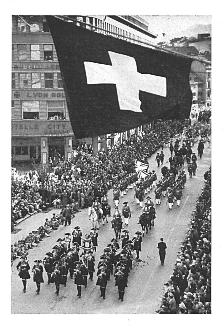
The historical procession through the business quarter in the centre of Zurich.