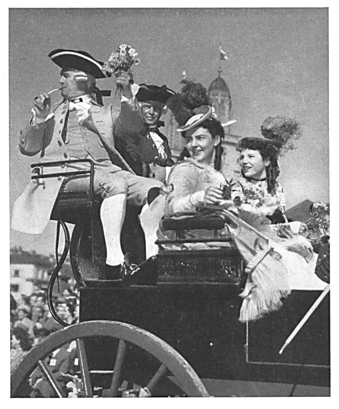
In the «Good Old Days ».

* Battle of Morat won in 1476 by the Swiss over Charles the Bold, Duke of Burgundy.