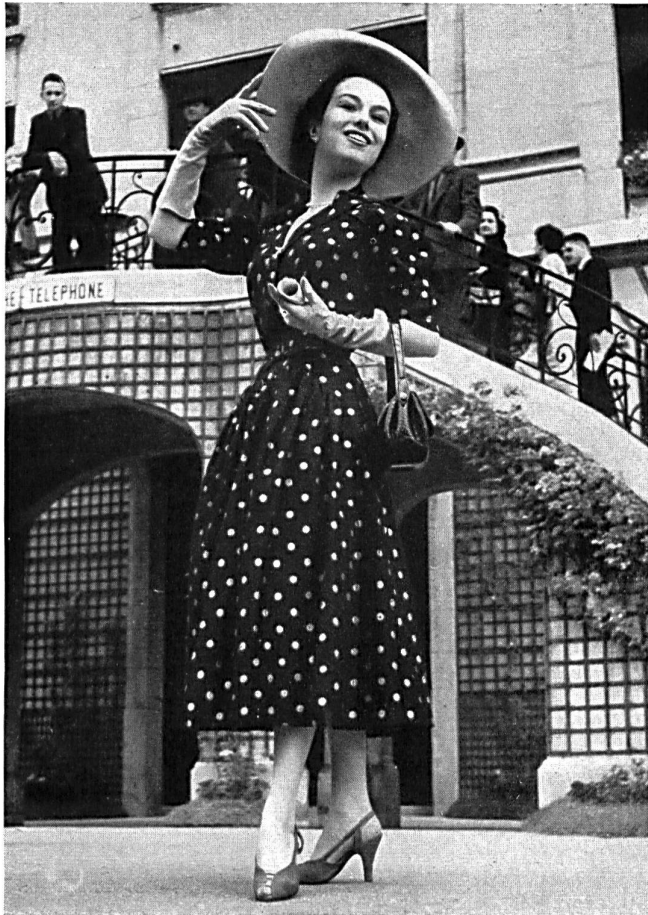
Auteuil : Grand steeple-chase. Robe de Maggy Rouff.

almost identical jackets go off towards the start at the Carrefour des Cascades... Another race is about to begin.