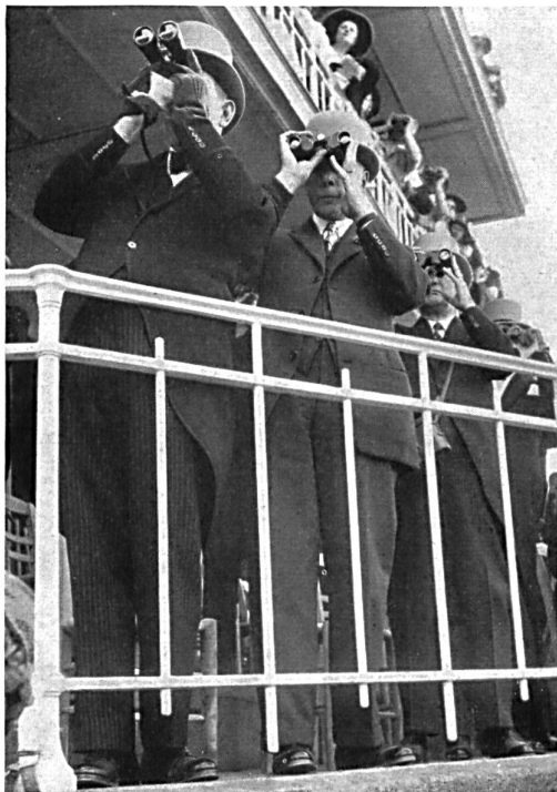
Chantilly : Prix du Jockey-Club, « Derby français ».