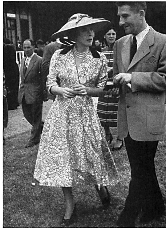
Chantilly : Prix du Jockey-Club. Une robe en imprimé qui fut fort remarquée.

At the opposite side, at the Porte d'Auteuil, buses of all sizes wait patiently for the passengers drawn by the shouts of the drivers : « Clichy... Porte des Lilas... Nation... » Like an egg breaking in two, Auteuil has disgorged on one side all the elegance of the enclosures and the grand stands, and on the other the masses from the public enclosures.