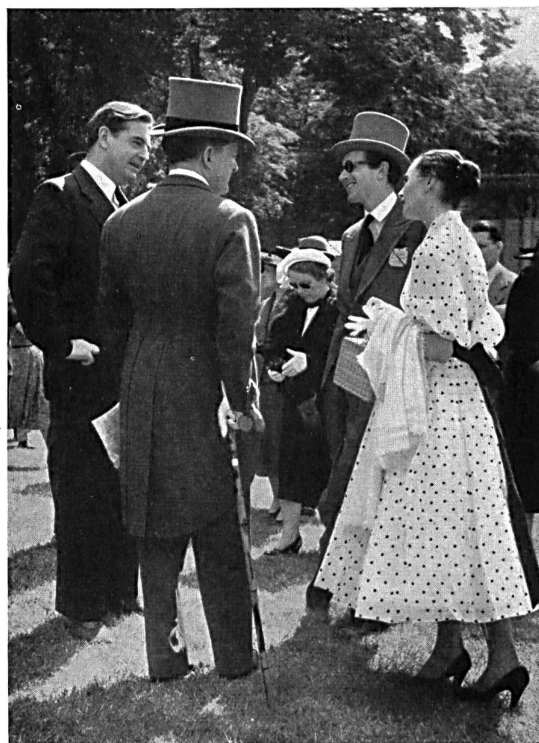
Chantilly : Prix de Diane (1952).