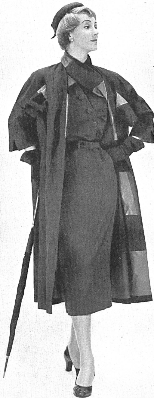
ELISABETH ARDEN Ensemble of black silk faïlle française by Schwarzenbach Huber Co., New York, fabric manu- factured by Robt Schwar- zenbach & Co., Thalwil.

Cotton has become a more universal fibre than ever before, thanks to the new finishes and its use in combination with man-made fibres. Cotton fabrics are made in all types and qualities from the tailormade suit to the most vaporous of evening dresses. One is constantly coming across interesting new textures or designs, quite different from anything one has ever seen before. The existence of keen competition and the great number of imports