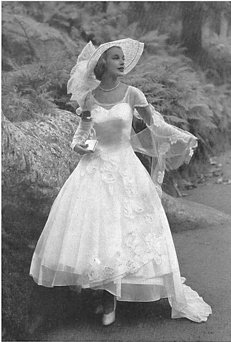
Embroidered organdy with detached flowers by Forster Willi & Co., St-Gall.