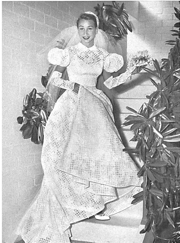
Bridal gown. Fabric by Staffel & Co., St-Gall.

An interesting sidelight on the business methods of Cahill, Ltd. is the fact that finances are kept in a position to buy anything new or original or highly desirable in