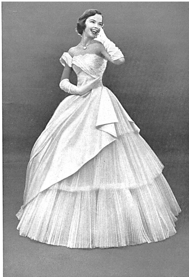
Evening dress in pleated tulle by Swiss Net Company Ltd., Münchwilen.