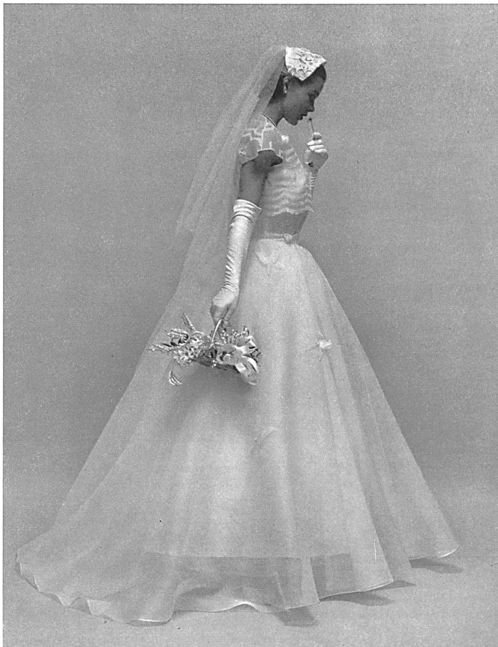
Bridal gown. Embroidered organdy appliquéd on organdy by Jacob Rohner Ltd., Rebstein.