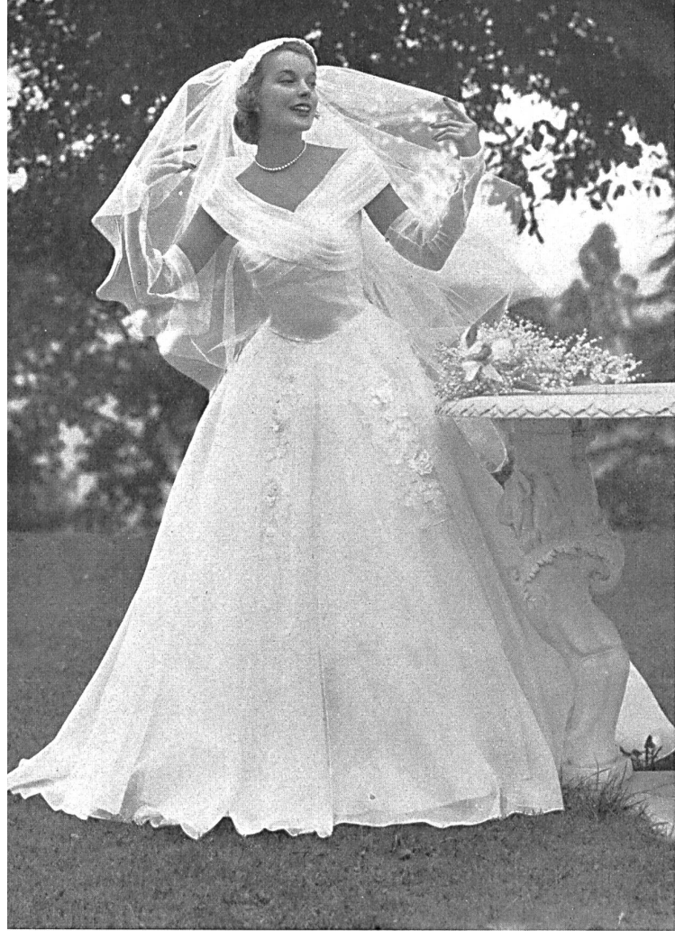
Bridal gown. Embroidered organza by Forster Willi & Co., St-Gall.

that individual plans may be worked out to help the bride coordinate her trousseau, select china, silver and linens and set up a registry for inquiring friends who are anxious to give gifts that will fit into a harmonious plan for the happy couple's home. Clever store owners have been quick to realize that the Cahill Room brings unlimited expenditures often in remotely related departments, by brides-to-be and their families and friends.