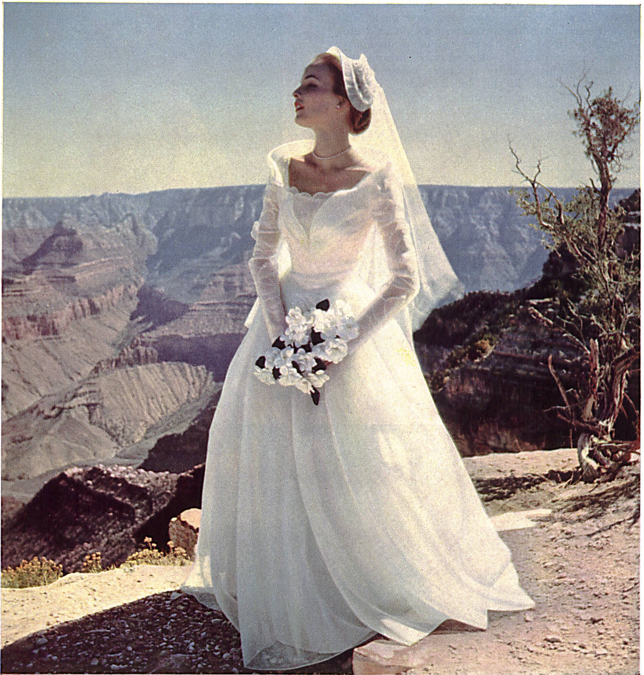
Bridal gown. White sheer cotton fabric by Stoffel & Co., St-Gall.

Swiss goods although there is strict budgeting and pre-planning for domestic goods.