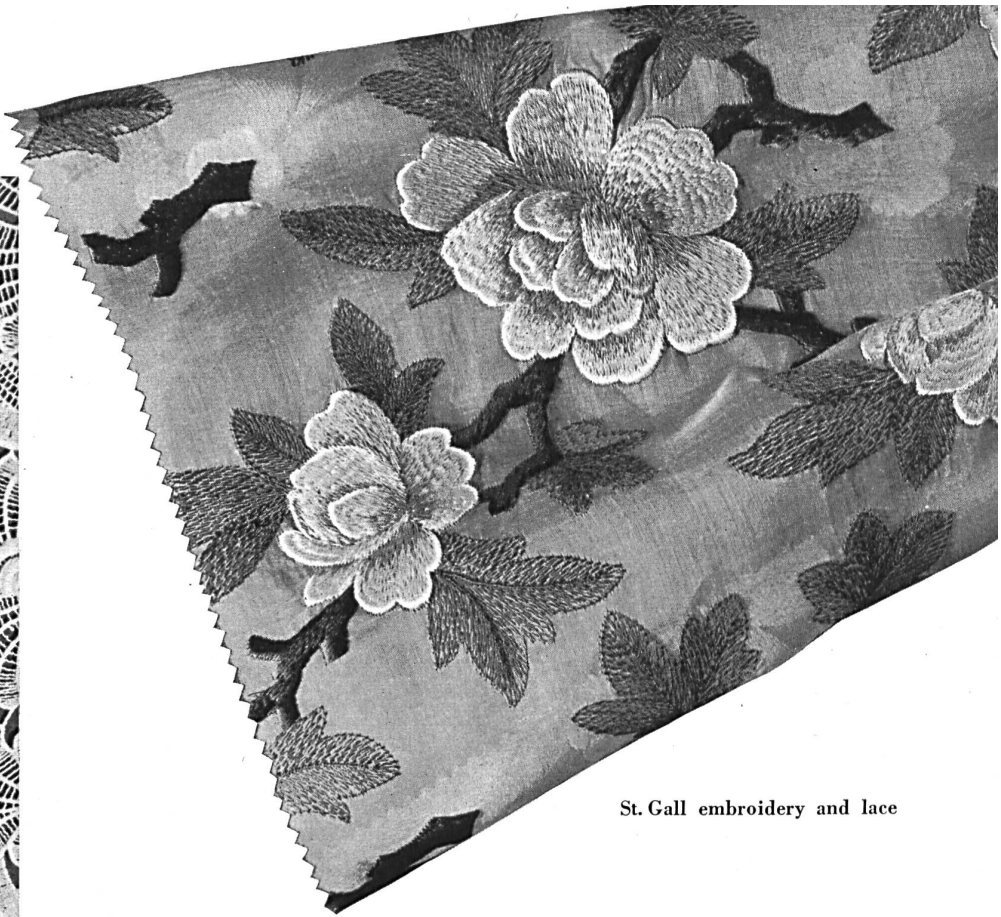
St. Gall embroidery and lace

on the average, 14 1/2 " from the ground, that the beltless princess line is counterbalanced by the classical line, that the basques of suits are very short often buttoning all the way down, that bows are everywhere, at the neck, the waist, on the skirt, on the lapels, that there are still many tweeds — and a great number of the ever practical cocktail dresses swaying some 5" from the ground, and that there is evidence everywhere of great ingenuity, particularly in the details, and finally that the print reigns supreme with its richly flowered motifs.