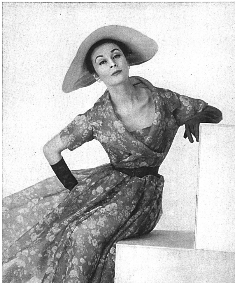
CHRISTIAN DIOR Zürich Silk

There is no collection more specifically «couture» than that of Jacques Fath, the man who crosses the Atlantic twice a year to launch a ready-to-wear collection. No collection more «couture» than those of Christian Dior or Balmain, who, as everyone knows, are both familiar with the same problems. And there is no point in quoting back