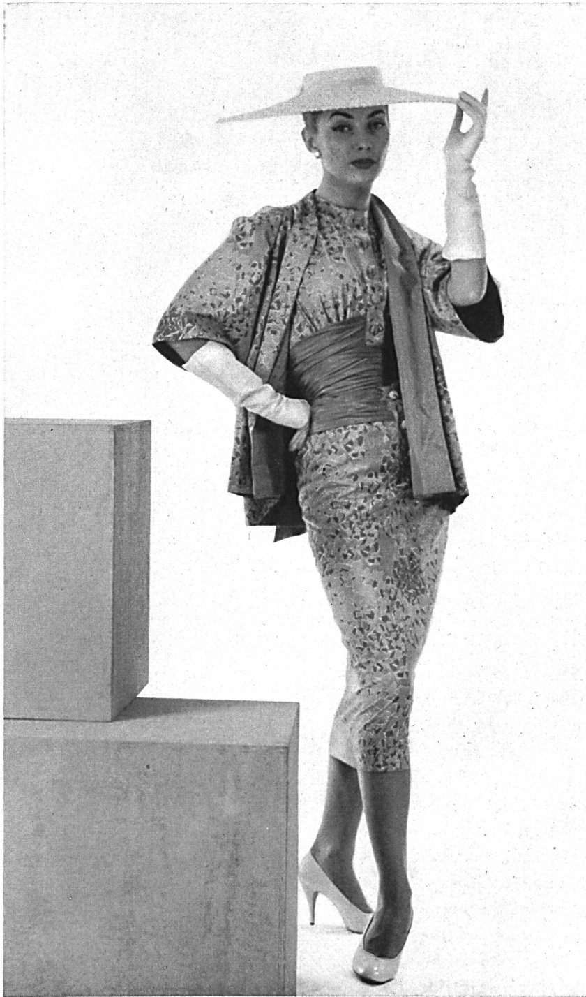
PIERRE BALMAIN Zürich Silk

the criticism, the scandal, the spreading of rumours, and under the jaundiced eyes of the copyists, the 1954 spring fashions were making their bow. Everyone knows that they are determined by a few leaders, the others embroidering on a general theme, succeeding sometimes as well — sometimes even better — but being less subject to scrutiny and less in the public eye since, by definition, they are outside the select group of leaders acclaimed by the press and sanctioned by their clients, the women of fashion. Not always, however, since on several occasions we have seen the journalists break out into pæans of praise, and the financial failure of their heroes follow close behind to prove that those who judge and those who buy may have very different opinions.