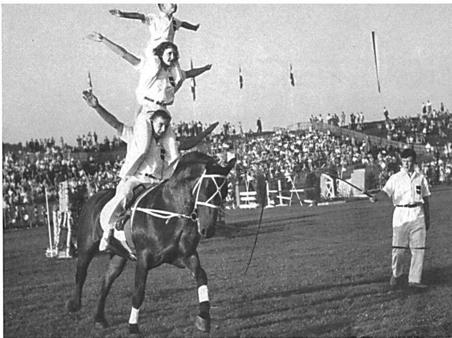
The acrobatic number by the young villagers of Elgg.