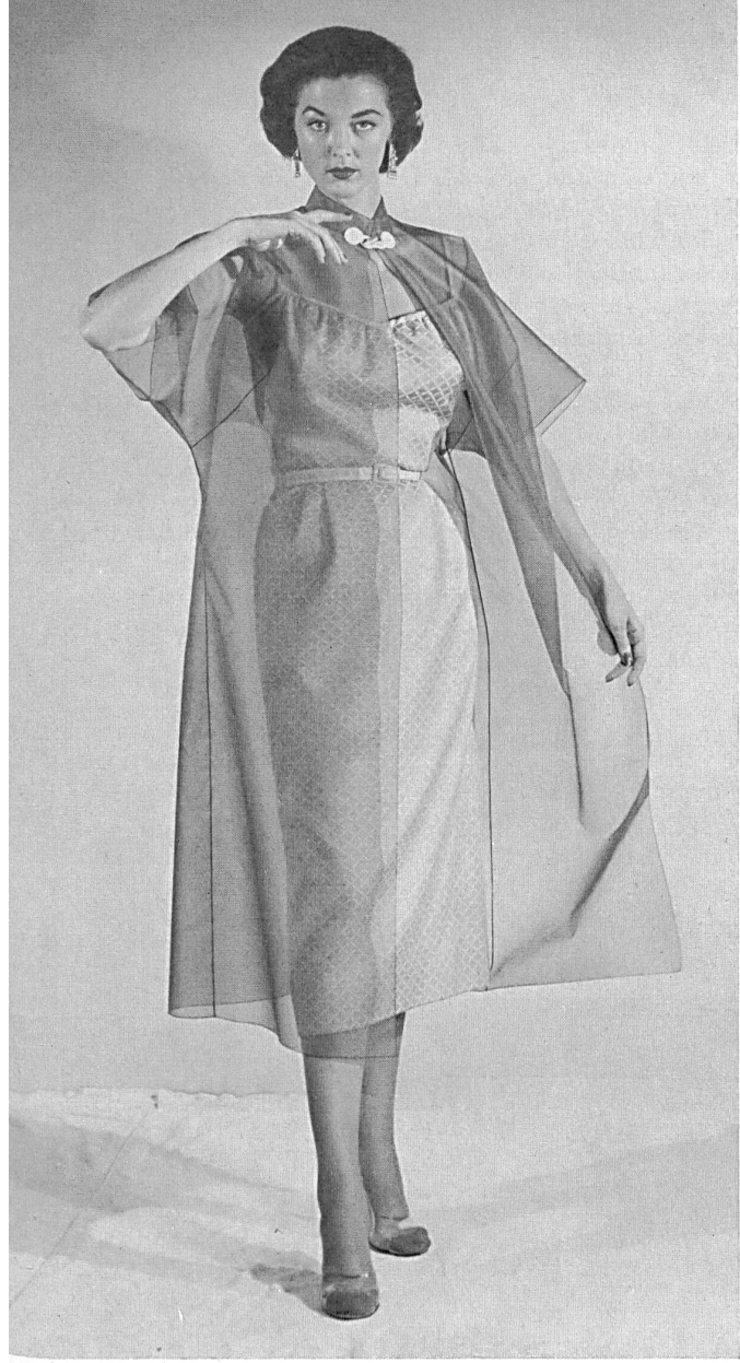
Dress of beige cotton Jacquard by Edwin Naef S.A., Zurich. Coat of bronze silk organza by L. Abraham & Co. Silks Ltd Zurich.

But you see, I never really wanted to be in show business. I was always afraid, too timid, too shy. I didn't like being stared at and deep in the back of my mind I always expected somehow to get back to designing clothes, not showing them off."