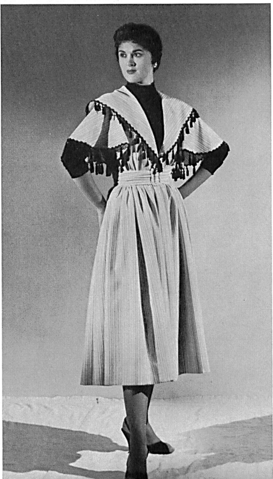
Spun rayon coat dress. «Zürrer» fabric by Weisbrod Zuerrer Fils, Hausen s.A.