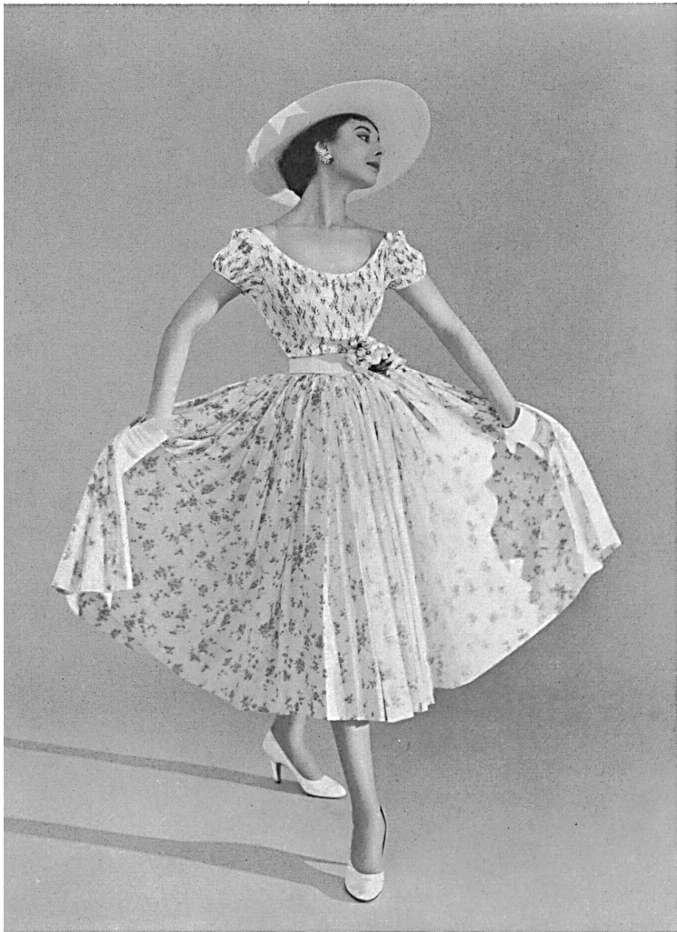
« Voiletta » cotton fabric with dainty posies print.