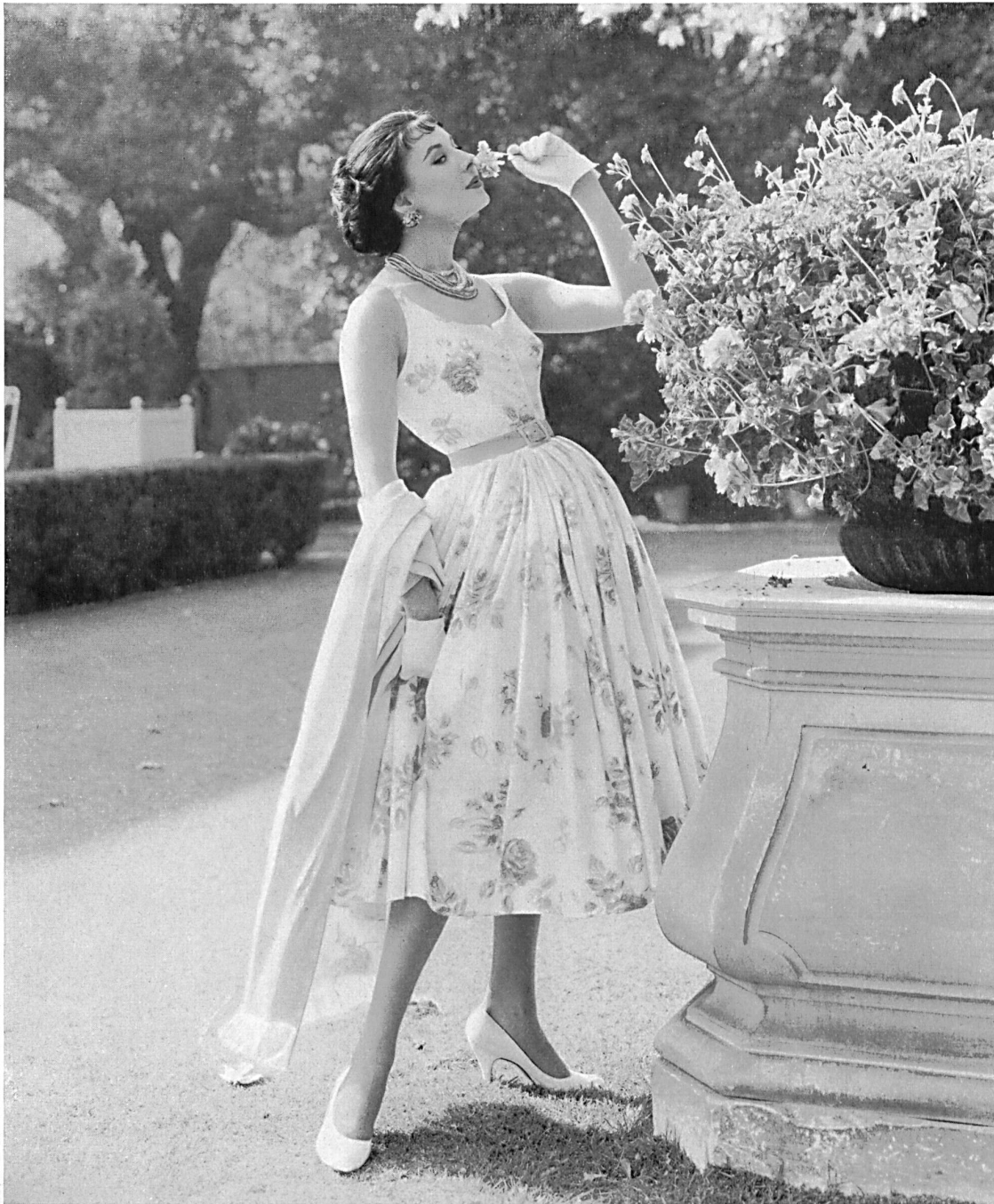
White cotton fabric with pink printed roses.

It all began only 29 years ago when James Galanos was born in Philadelphia. Born of Greek parents, he