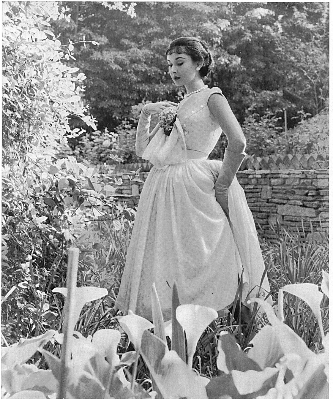
Blue check patterned cotton voile.

lived in small New Jersey and Pennsylvania towns until he left home at the age of 18 to work at "pushing fabrics around and picking up ins" in the famous salon of Hattie Carnegie. It was here he realized that his strong interests lay, and during his very simple apprenticeship he studied design in art school, learned the technique of draping and cutting, and being talented, sold sketches to various New York dress houses.