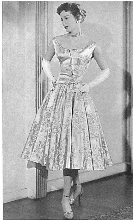
Frederick Starke Ltd., London Woven rayon by L. Abraham & Co., Silks Ltd., Zurich

beginning to appear in the first days of August in some London shops — although we may still have to face another heatwave or two !