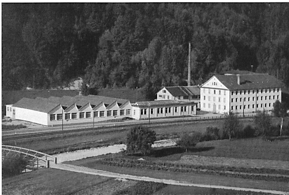
Weaving mills of the firm J. G. Nef & Co. Ltd. in Bauma.