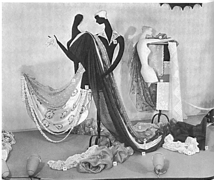
St. Gall embroideries and fine cotton fabrics.

The «Swiss Week» in Stockholm was a great success. Let us hope that it will have achieved its purpose by bringing about a lasting improvement in the trade relations between Sweden and Switzerland.