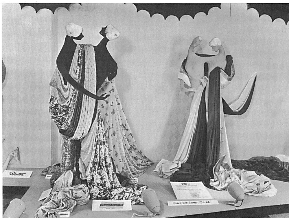
A section of the exhibition of the silk industry.