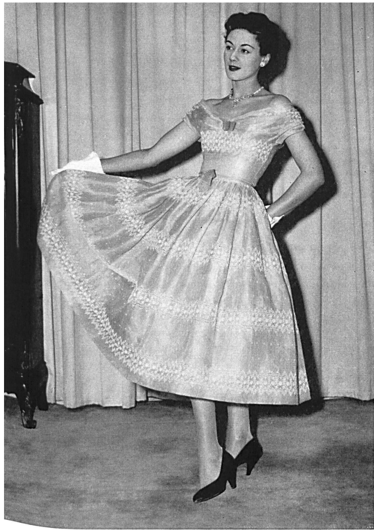
REICHENBACH & Co., SAINT-GALL White embroidered blue organdy Model by : Christian Dior Ltd., London