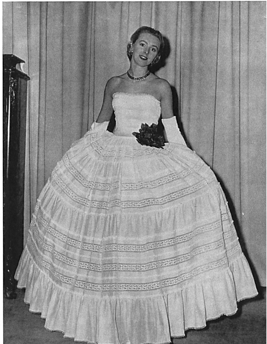
REICHENBACH & Co., SAINT-GALL White embroidered batiste Model by : Christian Dior Ltd., London

Bond Street, which makes its way narrowly from Oxford Street to Piccadilly, was at one time famed as the most fashionable thoroughfare in Europe and maybe of the world ; and even today it still retains much of its dignity.