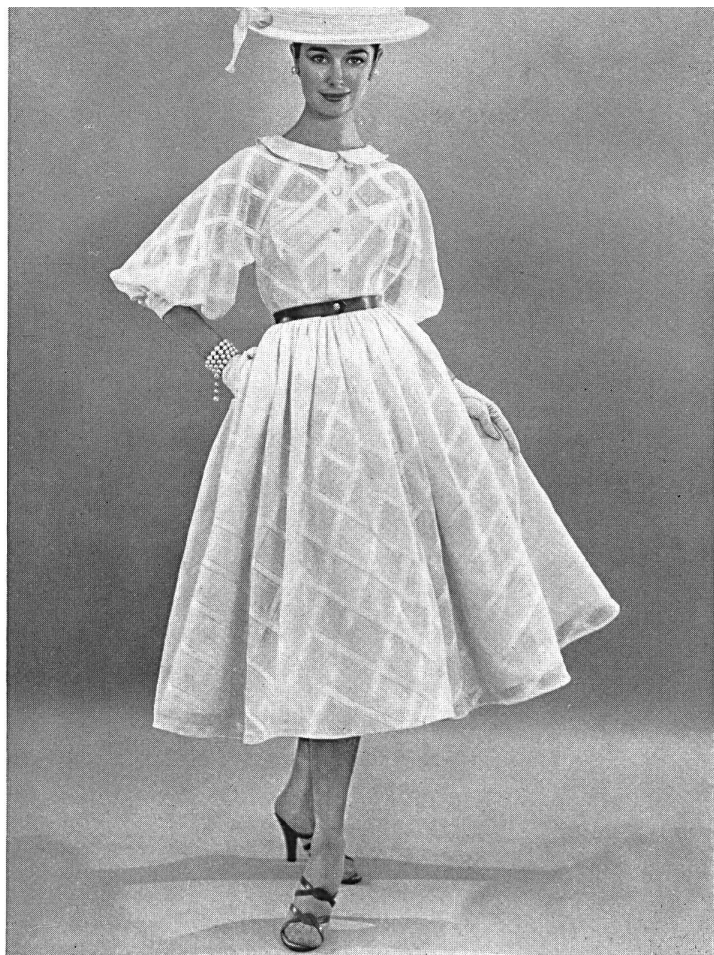
REICHENBACH & Co., SAINT-GALL

Colors no longer go by seasons. This summer there are a host of golden browns, greens and warm autumnal reds, as well as black and golden russets. These wintry colours are not at all out of place in July, and America, which takes a delight in colors, makes lavish use of them under a clear blue sky and in a light that is brighter than that of European climes. Cotton voiles, chiffons, coarse linens, fine linens and mixed fabrics are made in brighter, warmer colors which give a new and original look to these light fabrics which, henceforth, will be suitable for all seasons.