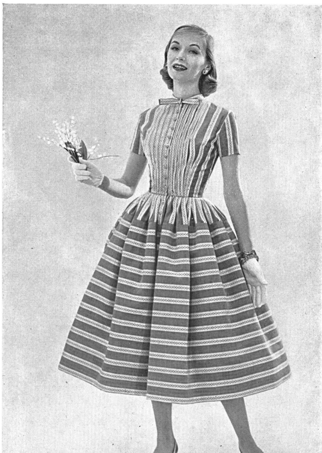
REICHENBACH & Co., SAINT-GALL