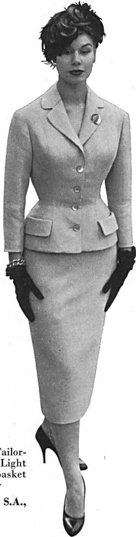
Switzerland : Tailor-made costume. Light beige pure wool basket weave worsted by Pfenninger & Co S.A., Wädenswil.