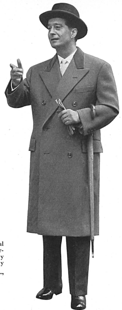
Switzerland : Classical double-breasted overcoat. Heavy blue grey pure wool Shetland by F. Hefti & Co. S.A., Hätzingen.