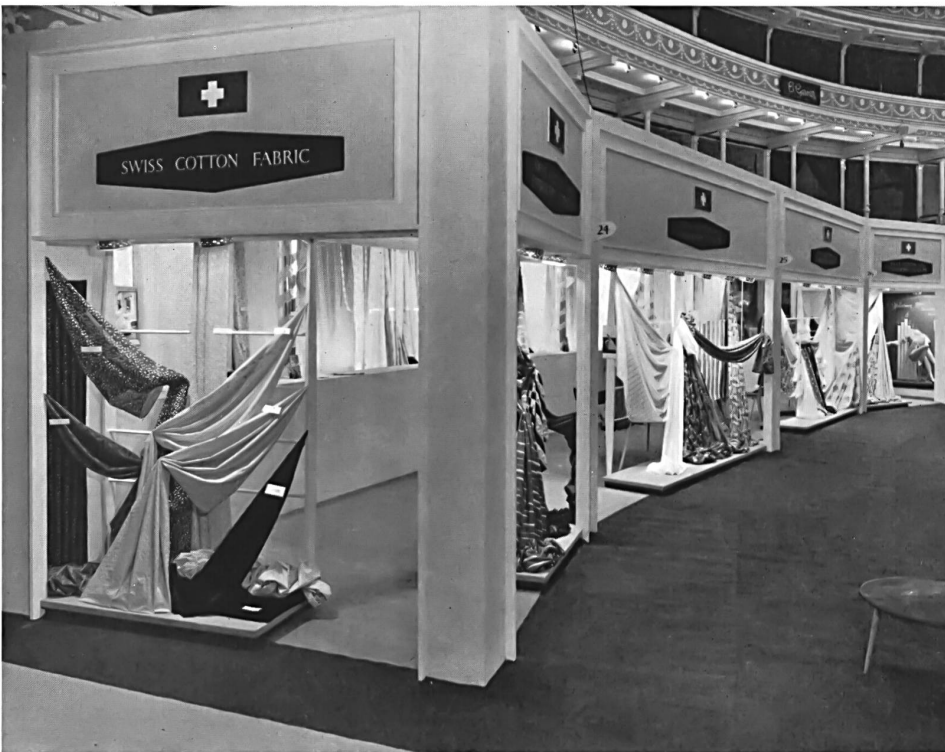
Stand of the Swiss Cotton and Embroidery Industry at the First International Trade Fashion Fair, London (November 18-22, 1957).