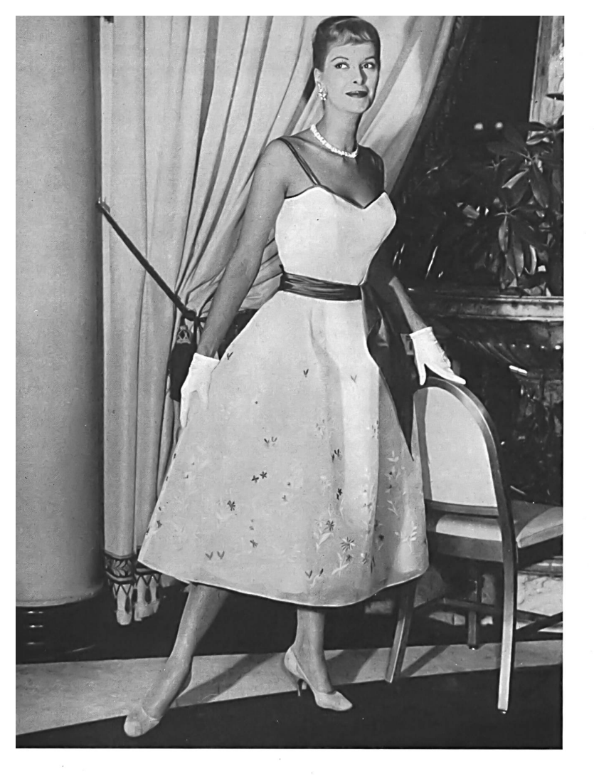
Embroidered white organdy with permanent finish. Model by Doge Separates, New York

to the tinkle of cups and saucers while keeping an eye open for a smart outfit for their next trip to the Bahamas. Here the atmosphere was rather that of an important opening, like that of a big Paris couturier presenting his creations to buyers from all over the world.