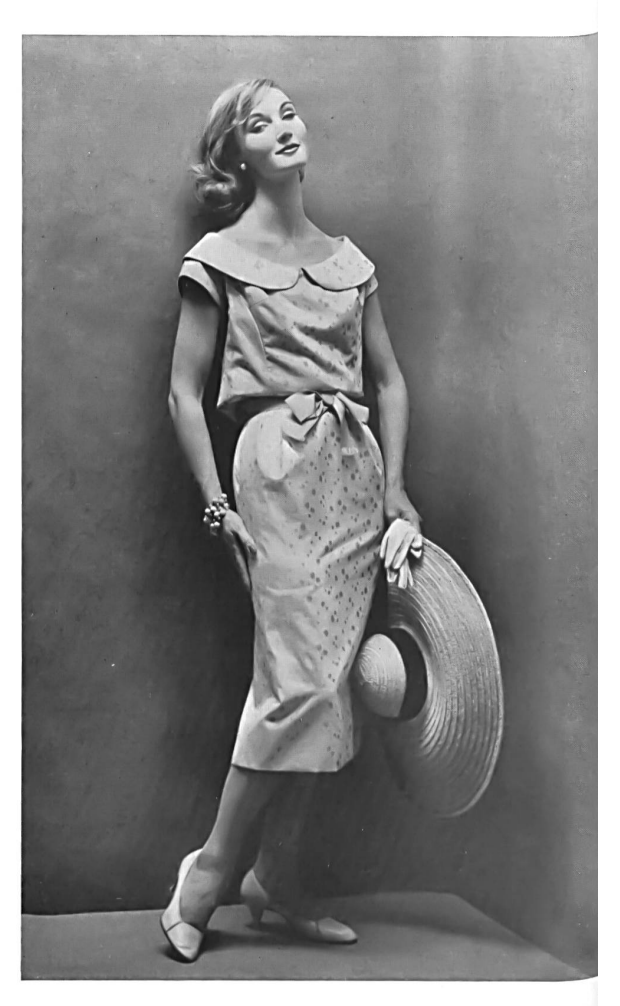
Cotton fabric with woven satin effects. Model by Adele Simpson, Inc., New York