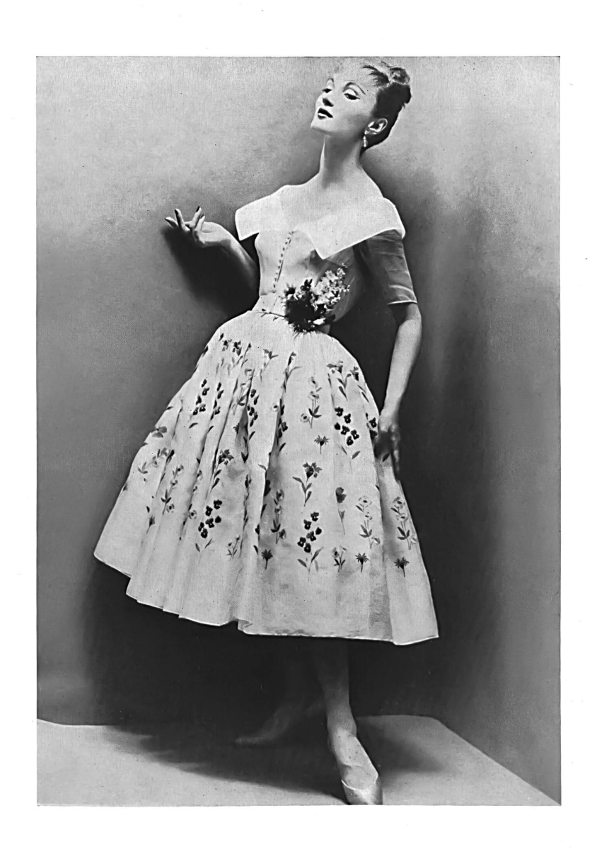
Embroidered white organdy with permanent finish.

Swiss Fabric Fashion Showing Spring 1958