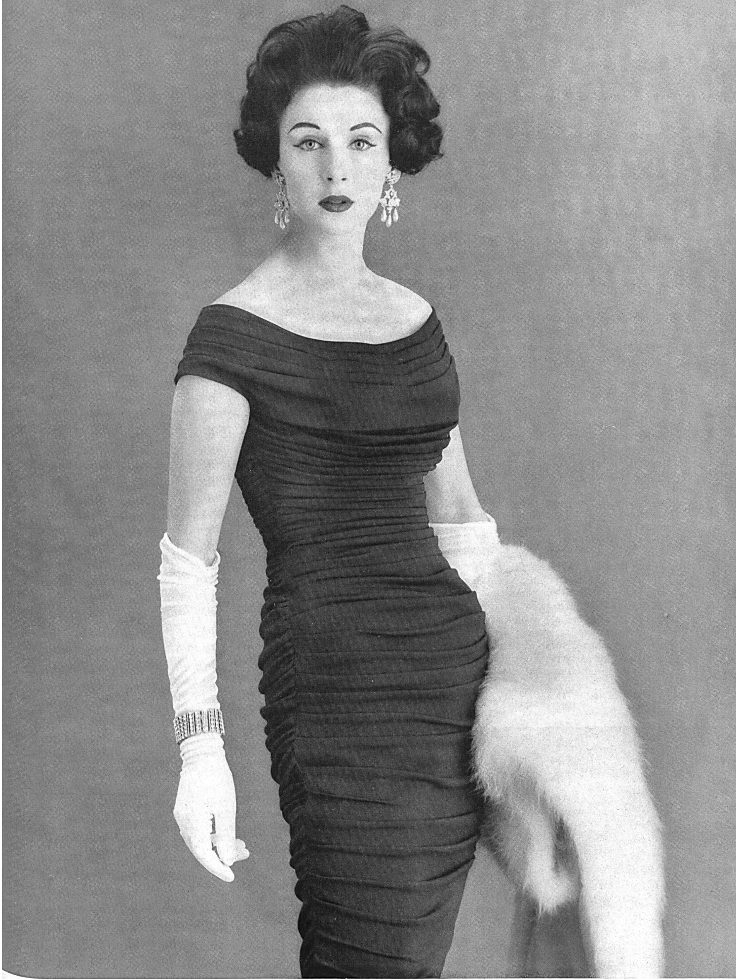
STEHLI & CIE, ZURICH Crêpe romain pure soie Pure silk crepe romain Modèle : Roter Models Ltd., Londres