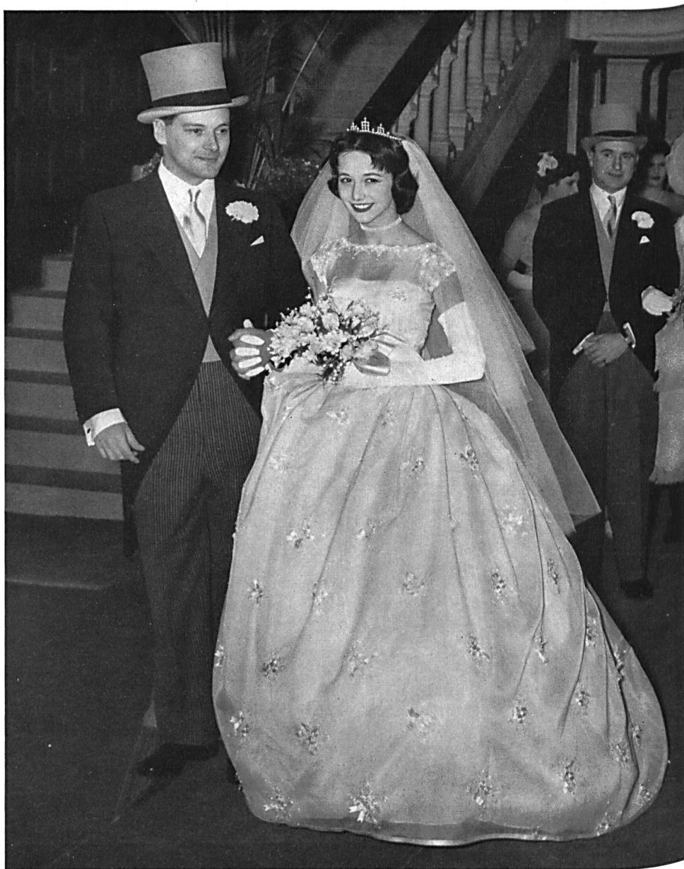
UNION S.A., SAINT-GALL Organdi de soie brodé Embroidered silk organdy Modèle: Newmar Couture, Londres

the present weak sales are, first of all, the increase in rents and the accompanying uncertainties for the many who are looking for new homes, then the mild autumn which coincided with the new higher rents—and the present unkind spell of cold, rainy, unsummery weather, and finally—in my opinion—a certain temporary hesitation on the part of the public on the new skirt length but principally (again this is my own opinion) because of the apparent lack of fashion adventure by many retailers. From my own observation it seems that it is the