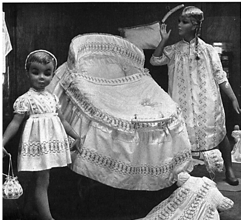
«RECO», REICHENBACH & CO., SAINT-GALL Elegantes broderies sur popeline Fashionable embroidered poplin Modèles et exposition: / Models and display: «The White House», Londres