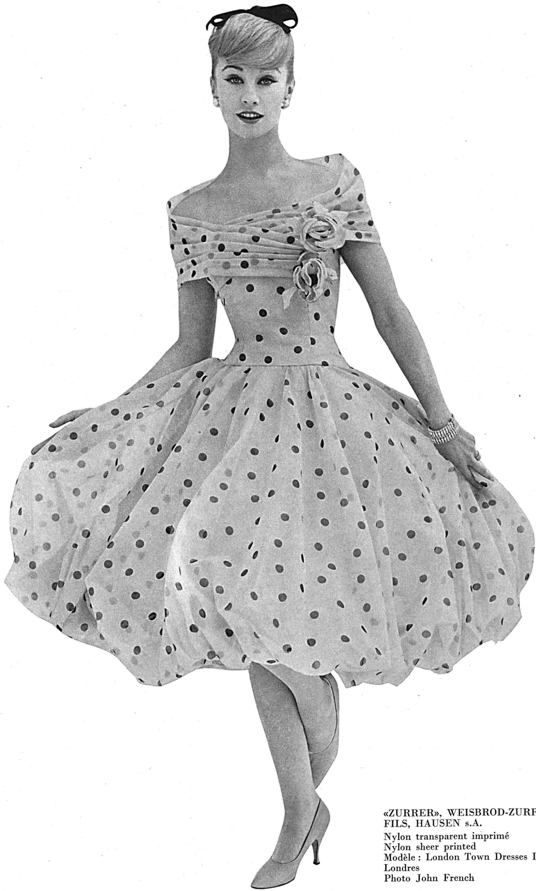
«ZURRER», WEISBROD-ZURRER FILS, HAUSEN s.A. Nylon transparent imprimé Nylon sheer printed Modèle : London Town Dresses Ltd., Londres