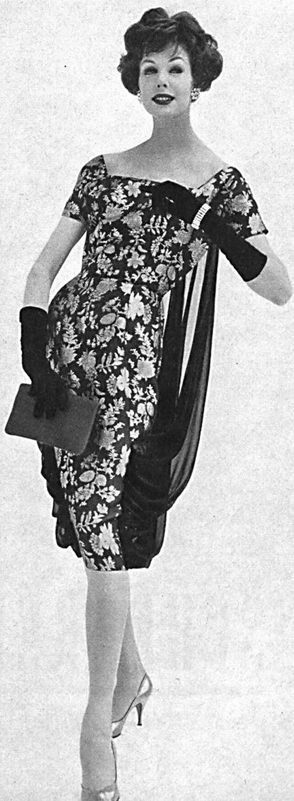
L. ABRAHAM & Co. SILKS Ltd., ZURICH Gold brocaded Basra. Model Roter Models Ltd., London.

The trapeze line in coats is still part of many British medium priced collections—but so is the much newer high-line rushed in at the last moment ; in dresses the chemise line is also included as well as the harem, bell, and the newly re-entered Empire or high-waist line. To add to the confusion a number of our British newspapers made such a sensation of the longer hem-line reintroduced by the House of Dior that some of the headlines seemed to have reached a near-hysteria. It was, of course, obvious that young Yves St. Laurent