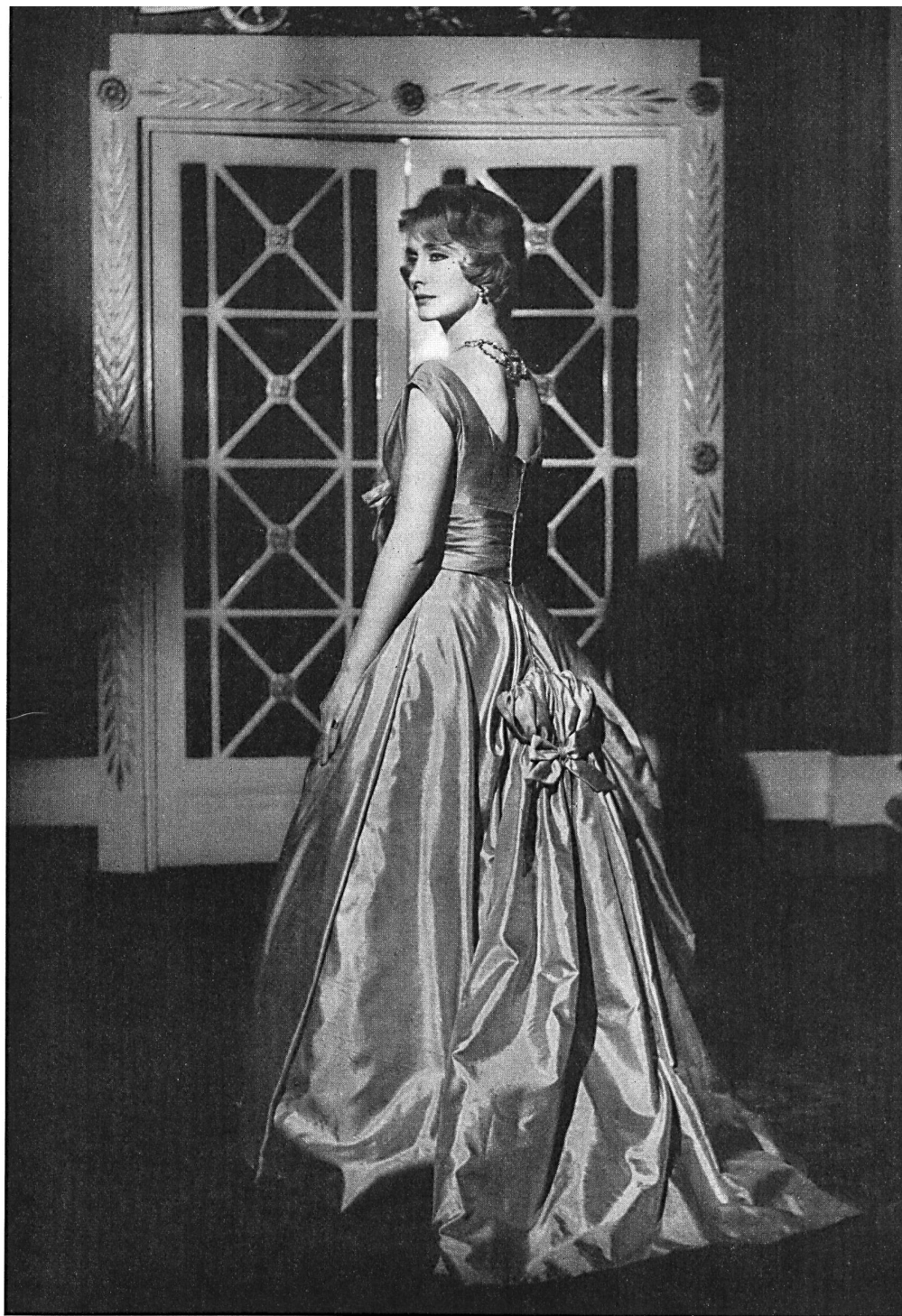
HONEGGER FRERES, WALD London Agent : Frank Loynes. Wild silk. Evening dress by B. & R. Sutin, London.

would be the focal point of interest ; but it is equally obvious that no one at the House of Dior could possibly have envisaged the sensational reports that appeared in the popular and even better British press. As all this happened before photographs could be published it would not be surprising if a large number of women here formed a completely wrong and grossly exaggerated mental picture of the new length. They could hardly have thought the hemline to be less than ten inches longer instead of about two for normal day wear !