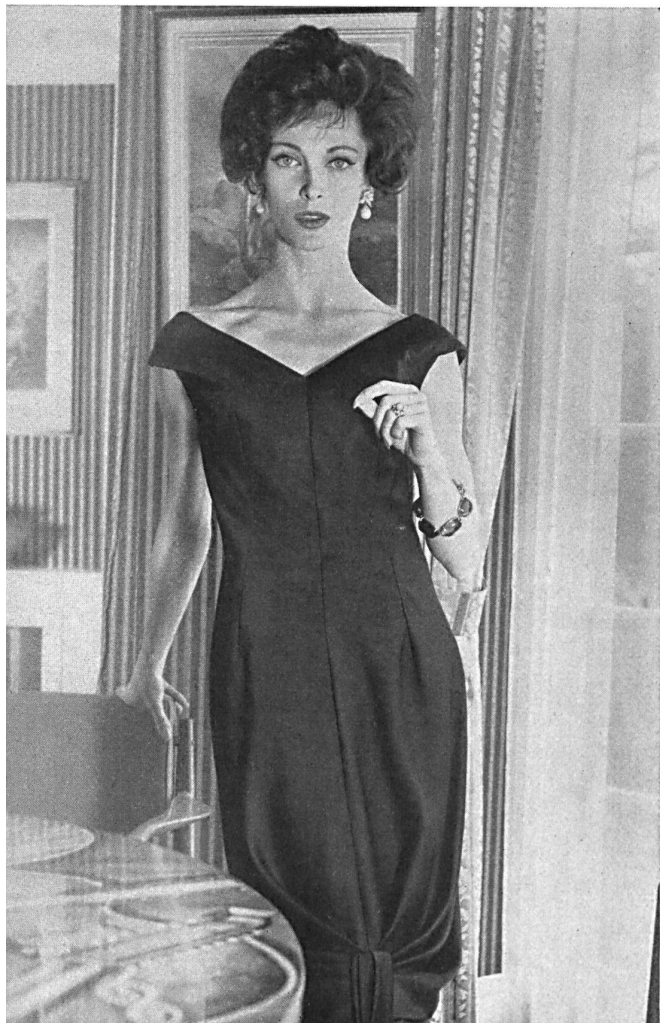
SOIERIES STEHLI S.A., ZURICH Pure silk morocaine. Model Roter Models Ltd., London.

Small and Frank Usher frequently use Swiss fabrics, while others such as Roter Models normally include a number of models made in Swiss materials.