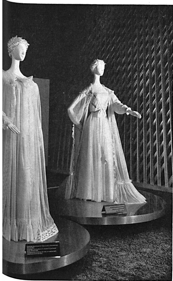
Société de la Viscose suisse, Emmenbrücke Négligés en nylon Nylsuisse.