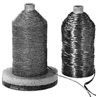
Société de la Viscose suisse, Emmenbrücke

In the "Rue des Boutiques" section, the Swiss Viscose Company exhibited more of its artificial straw, which replaces raffia nowadays for all types of fancy work and can even be used on hand-knitting machines for the manufacture of various articles such as skirts, hats, summer bags, etc.