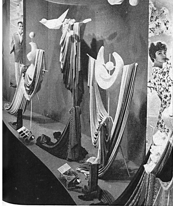
The Swiss wool textile industry was represented in several sections at SAFFA, in particular by a thematic exhibition of clothing. Here we see a view of the stand organised on the Fashion Merry-Go-Round by the Swiss Association of the Wool Textile Industry showing the products of 36 manufacturers.