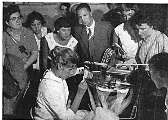
Société de la Viscose suisse, Emmenbrücke

At SAFFA, the Swiss Viscose Company was represented first of all by an information stand devoted to "Nylsuisse" nylon (registered trade mark) in the pavilion of the Zurich Institute of Household Research. It also had a display in the "Woman in Industry" hall, in the "Textile industry" group, organised by the Employers' Association of the Textile Industry. In addition to the numerous fabrics man made fibres displayed in the "Silk Tower" (see page 150, fig. 3), it had a stand giving the visitor information concerning the manufacture and use of all the firm's products: nylon, rayon and staple fibre yarns, artificial straw for braiding, artificial hair for wigs, etc.