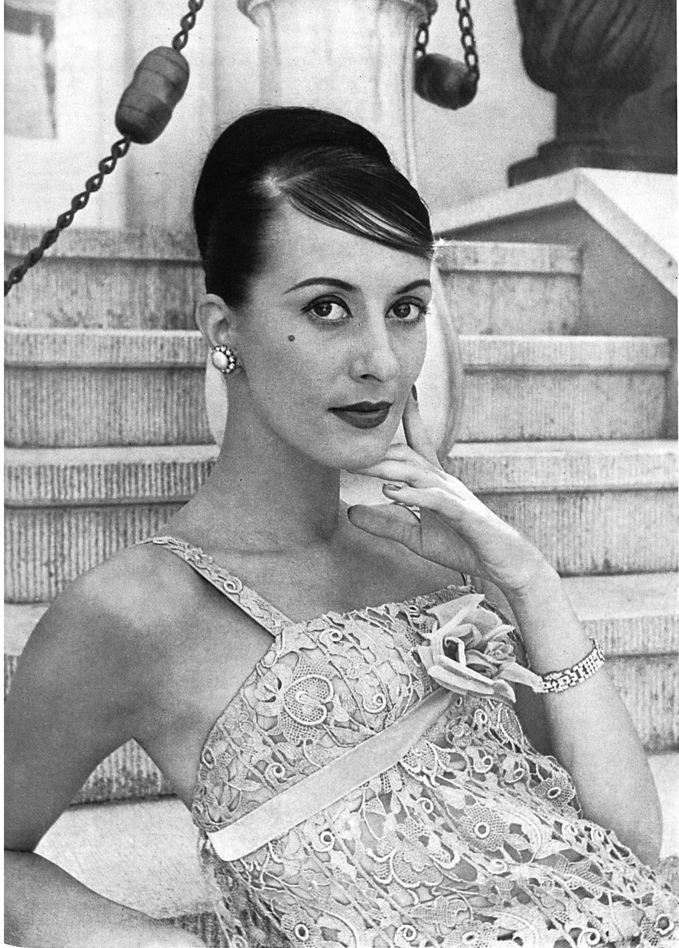
FORSTER WILLI & CO., SAINT-GALL Broderie or / Goldspitze. Modèle Charles Ritter, Hambourg-Lubeck.