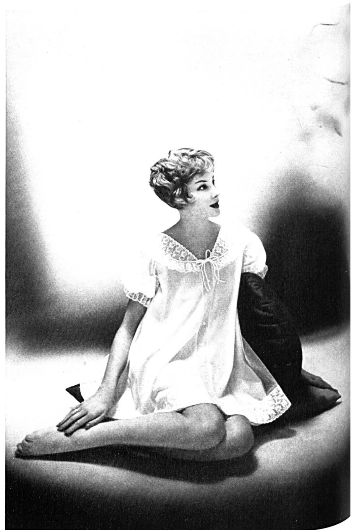
BISCHOFF TEXTILES LTD., SAINT-GALL

Embroideries on nylon. Broderies sur nylon. Model by Kickernick, Inc., Minneapolis.