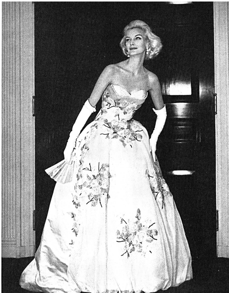
FOSTER WILLI & CO., SAINT-GALL

The fine cotton fabrics, embroideries, woollens, mixed fabrics and tricots imported from Switzerland owe a considerable part of the excellent reputation they enjoy in American ready-to-wear circles to the continual progress made with regard to finish and dyeing. All the ultra-modern qualities, such as Wash-and-Wear, Drip-and-Dry, No-Iron, are possessed by these Swiss articles, even the fragile embroideries and fine Victorian style cotton fabrics, which are still triumphantly up to date in this era of jet aircraft and atomic power. Cilander of Herisau has