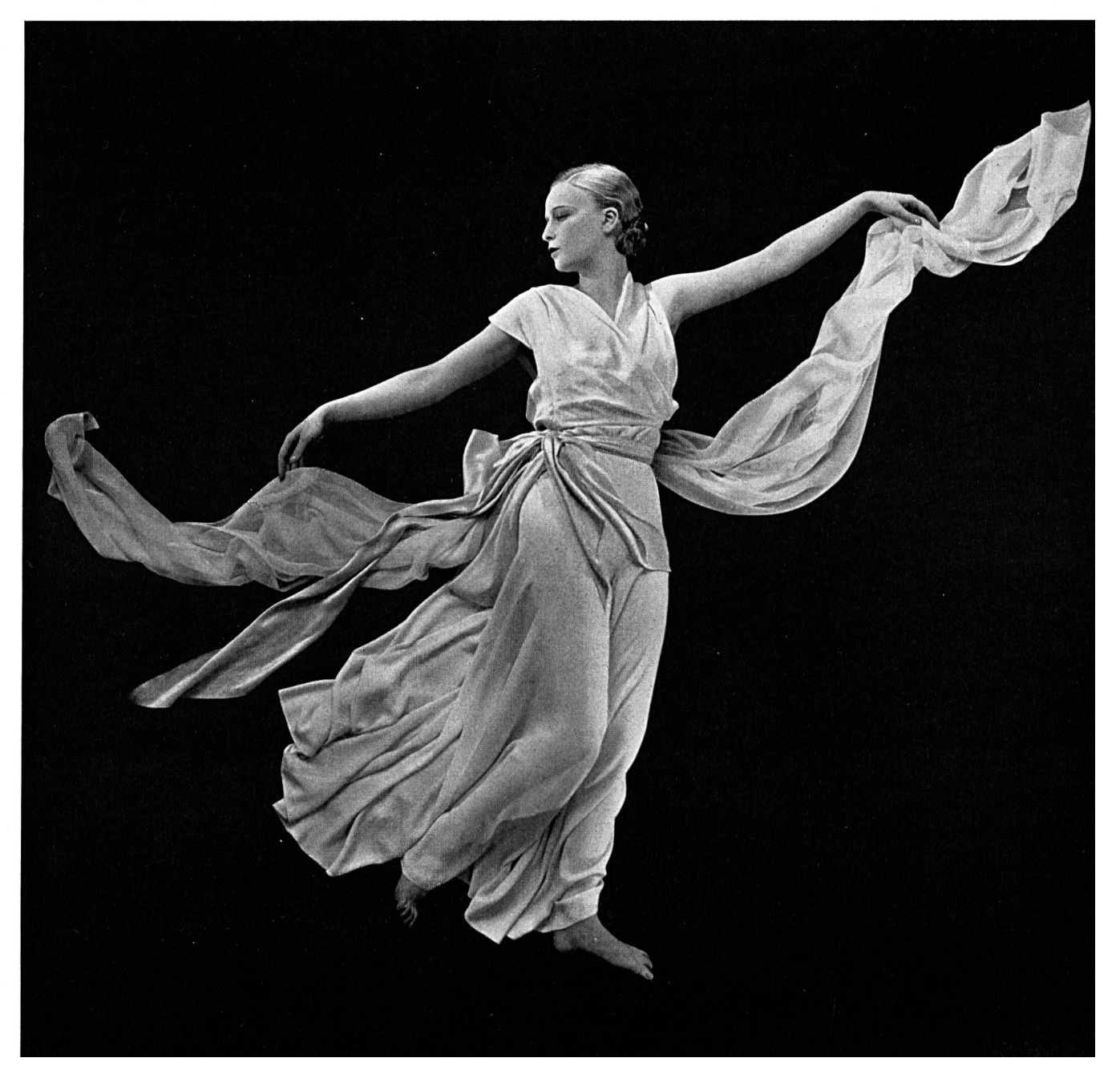
Draped by Madeleine Vionnet