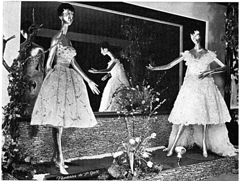
The display of embroideries in the theatre lounge