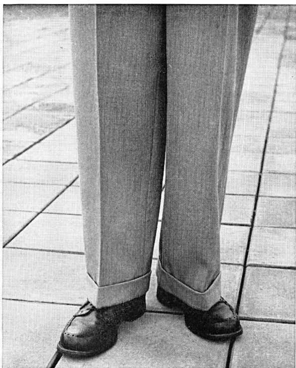
Pantalon mouillé puis séché A gauche : traité au SI-RO-SET ; à droite : non traité Trousers dried after having been wet Left : treated with SI-RO-SET, right untreated Pantalón mojado y secado A la izquierda : tratado con SI-RO-SET. A la derecha : sin tratar Die Hose wurde durchnässt und wieder getrocknet Links : mit SI-RO-SET behandelt, rechts unbehandelt

For many years trouser creases and skirt pleats were the bane of every man and woman's existence ; no matter how well put in, they soon required fresh attention on the part of the wearer. Luckily these troubles are now nearly over as there exists a simple means, called SI-RO-SET, of making creases and pleats in woollen fabrics permanent. This new process was thought out and