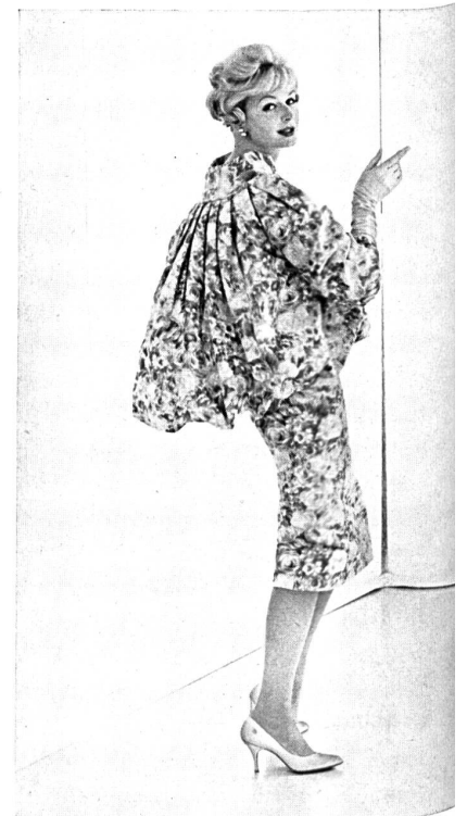
L. ABRAHAM & CO. SILKS LTD., ZURICH

The House of Werlé has specialized from the beginning in fine, imported fabrics that give its fashions a unique flavor combined with the « je ne sais quoi » of California styling. The resulting success has confirmed this designer in his policy and has resulted in increased purchases from abroad with a large part of its total coming from