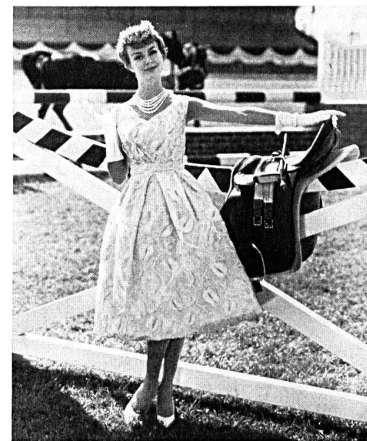
FORSTER WILLI & CO., SAINT-GALL

Embroidery Modèle Haury & Co., Saint-Gall