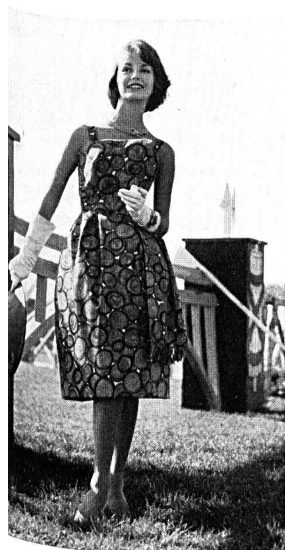
METTLER & CIE S. A., SAINT-GALL

Organdie with chenille embroidery Modèle Gack, Zurich