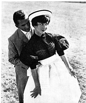
UNION S. A., SAINT-GALL

St. Gall always combines its great sporting event of the year with the presentation of the loveliest creations of its