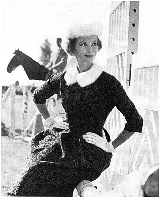
STOFFEL & CO., SAINT-GALL