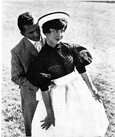
UNION S. A., SAINT-GALL

St. Gall always combines its great sporting event of the year with the presentation of the loveliest creations of its