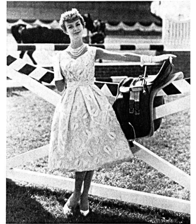
FORSTER WILLI & CO., SAINT-GALL

Embroidery Modèle Haury & Co., Saint-Gall