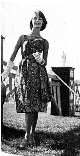
METTLER & CIE S. A., SAINT-GALL

Organdie with chenille embroidery Modèle Gack, Zurich