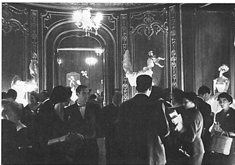
Some aspects of the « Swiss Fortnight »: window displays— at the exhibition—the fashion parade