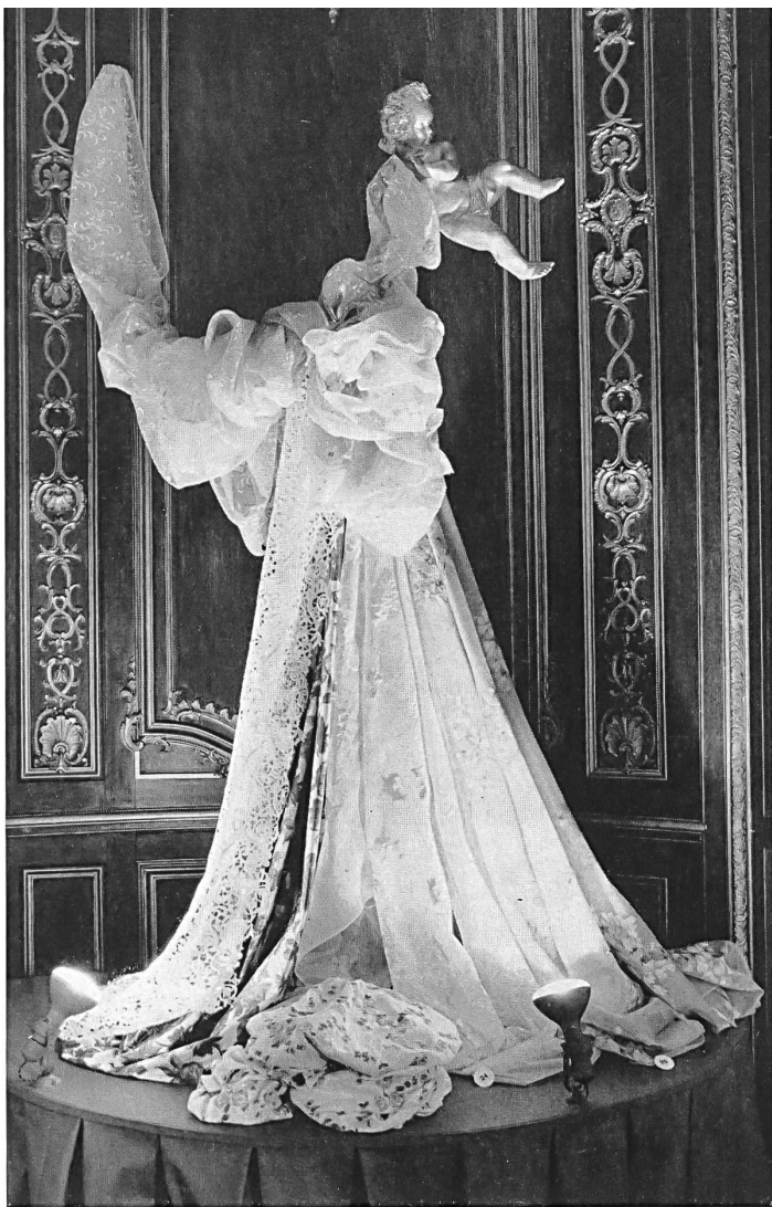
A glimpse of the display of embroideries