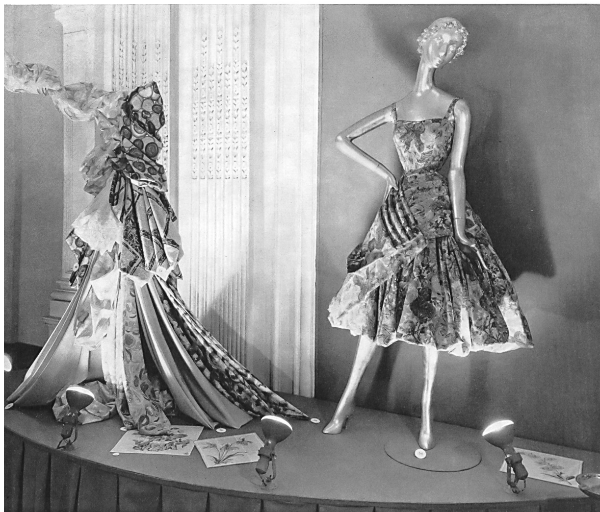
A glimpse of the display of fine cottons