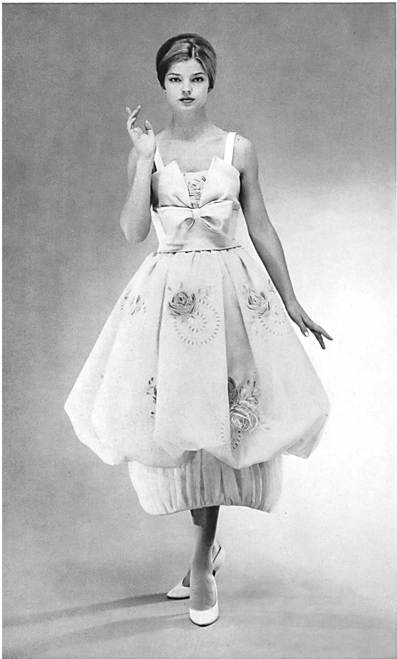
Modèle Gack, Zurich REICHENBACH & CO., SAINT-GALL Pure silk embroidered organdie Photo Guniat