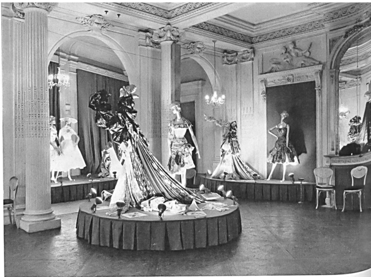
The display of fine cottons

Apart from the decentralised exhibitions in the shopwindows — of which we give a few glimpses here — there were also several displays of Swiss ready-to-wear clothing. One organised for British trade buyers and the trade press met with such remarkable success that instead of the 400 to 500 spectators expected, over 1000 came to see the more than 180 models shown, including some fifteen evening and cocktail dresses made specially for the occasion in St. Gall embroideries and fine cottons. Another display took place at a charity ball given at the Dorchester Hotel on behalf of the Pestalozzi