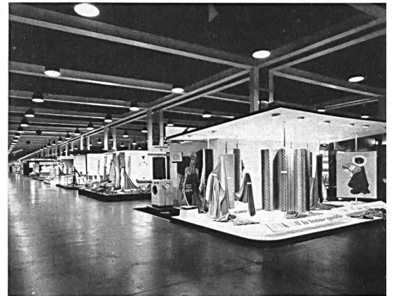
Some of the stands in the textile halls.

The success met with last year by the „Knitwear centre” encouraged its organisers to repeat the idea this