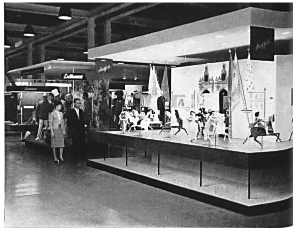
The stand of Stoffel & Co., St. Gall

As every year, the Swiss Industries Fair in Basle set aside considerable space this year (from April 23rd to May 3rd) for the Swiss textile and clothing industries. It should be pointed out that this industry with almost 250 exhibitors is numerically among the strongest at the Fair; together with the 25 exhibitors of the "Footwear and Leather Goods" section it accounts for 10 % of the total number of exhibitors, a figure achieved by no other group.