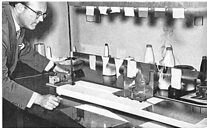
Testing the inflammability of different textile samples.

The first talk was devoted to new developments in the field of nylon fabrics and was an opportunity for members of the press to get acquainted with a certain number of comparatively new products with a nylon base, which are appearing more and more frequently in the news. "Helanca" yarn (Regd. trade mark) is the oldest and best known of these products. It is an extremely elastic, crimped yarn, with numerous possibilities of use; it was created by the Swiss firm of Heberlein & Co. at Wattwil and is known and used today throughout almost the whole civilized world (see Textiles Suisses No. 2/1960, pages 164-165). Among the other products that are manufactured with Nylsuisse, let us also mention "Ban-Lon" (Regd. trade mark of the firm of Joseph Bancroft & Sons Co., Wilmington), made under licence in Switzerland by the Société de la Viscose suisse. This is also a bulky, crimped yarn mainly used for the manufacture of hosiery and knitwear. "Taslon" (Regd. trade mark of Du Pont, USA, and the Société de la Viscose suisse) is another bulky yarn in which the tiny fibres of which each yarn is composed possess an infinite number of little curls or