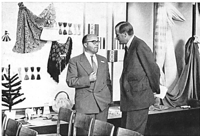
During the Press reception at Emmenbrücke by the Société de la Viscose suisse.