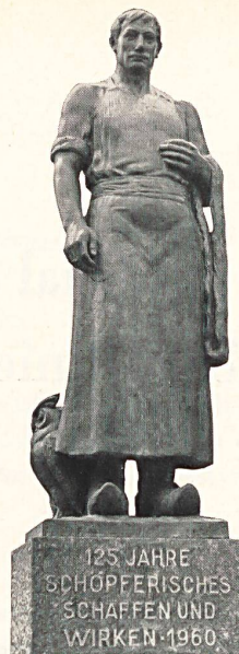
The dyer's statue, on the Heberlein fountain, at Wattwil